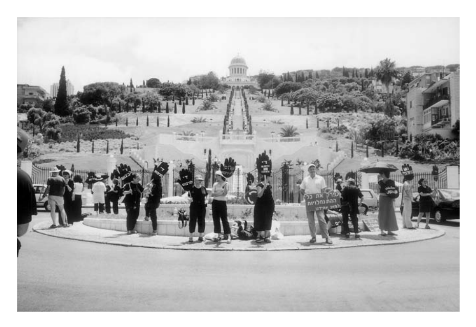
Figure 4.1 The Haifa Women in Black, 2002.