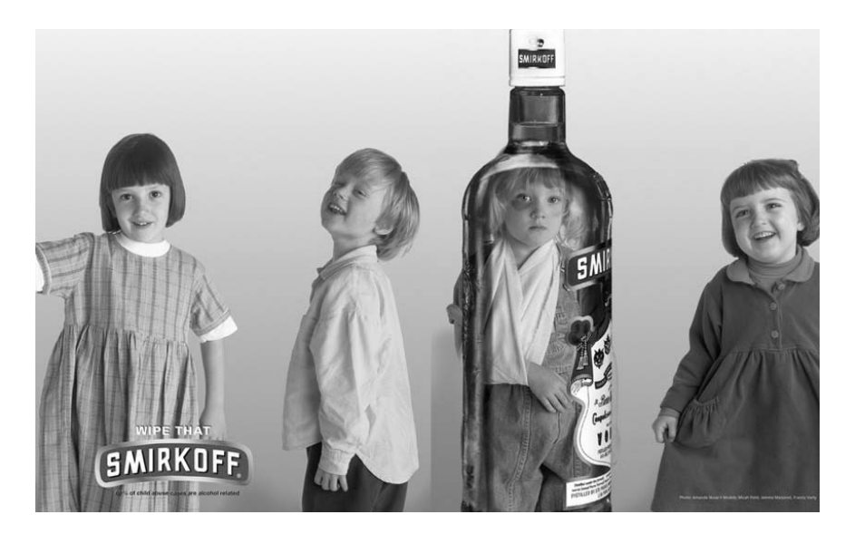
Figure 6.2 'Wipe that Smirkoff' (www.adbusters.org).

bottle. In the spoof-ad, Smirnoff is changed into Smirkoff. To smirk is to smile or laugh scornfully. We see ordinary apparently happy kids, but through the vodka bottle we are invited to see the truth of vodka: childabuse and violence in families with alcoholic parents. The spoof-ad suggests that the producers of vodka smirk at the abused child. They make profit out of the little girl's tragedy.