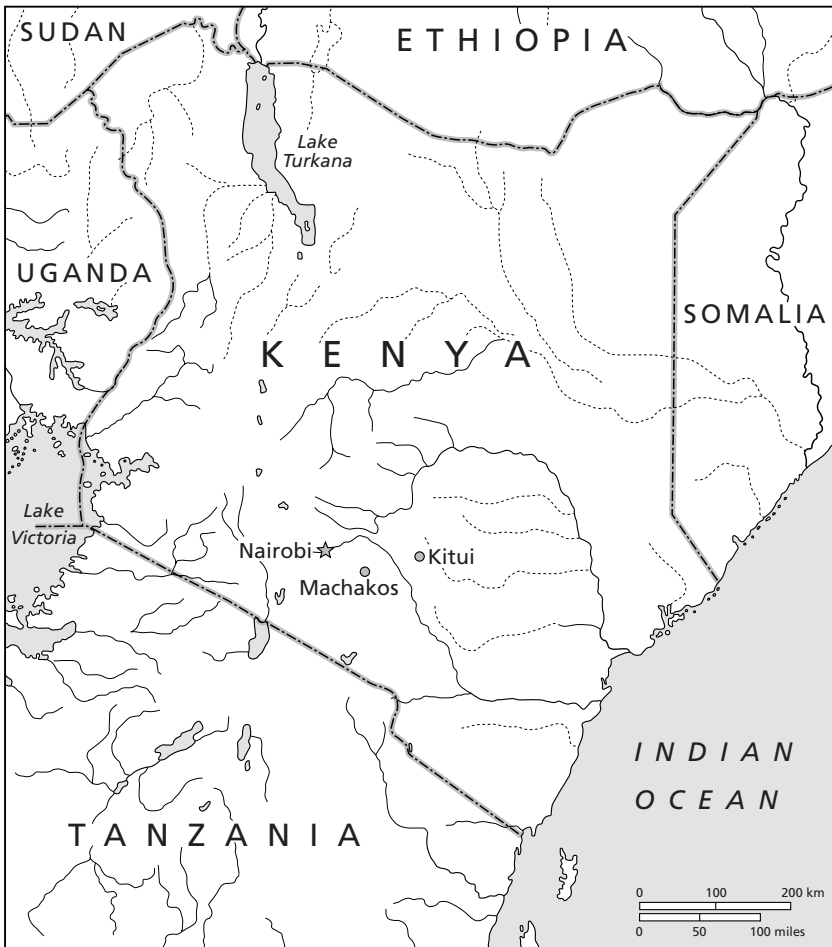
Nairobi, Machakos Town, and Kitui Town.