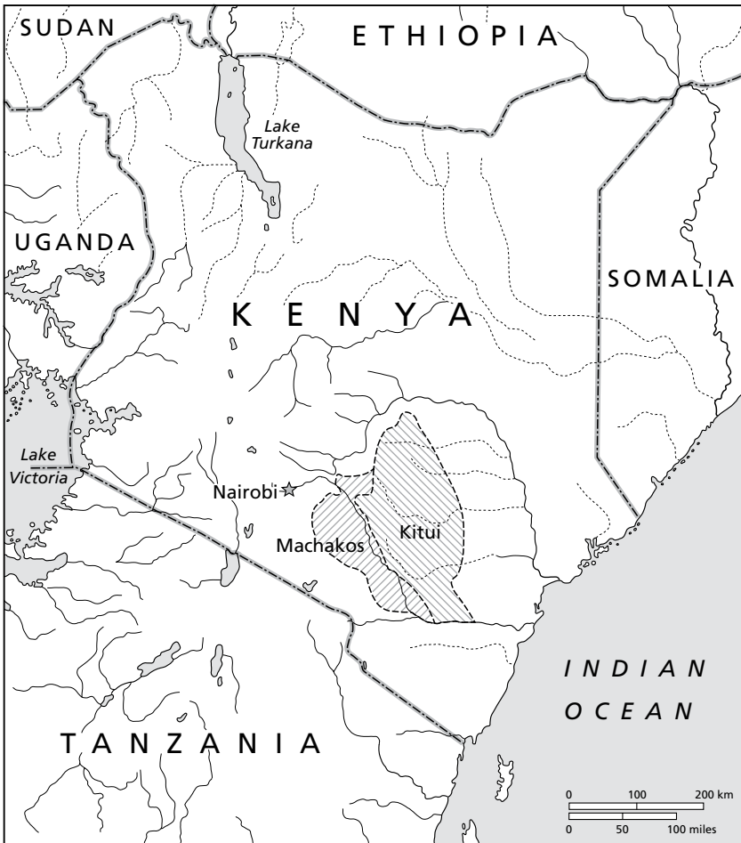
Machakos District, Kitui District, and Nairobi.