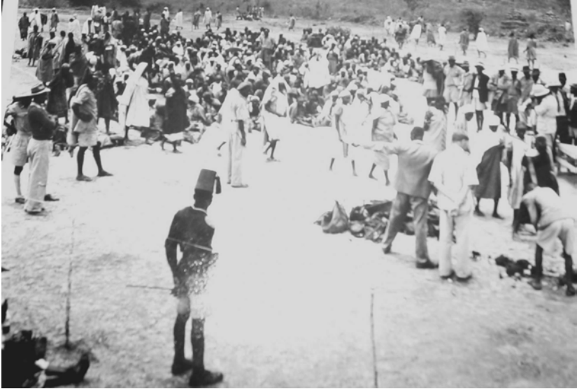
PHOTOGRAPH 4. Burning witchcraft in Mau Mau-era Machakos.

Oral histories of “ordinary” Kamba outside the administration’s employ bear out these ex-officials’ contentions. For example, one informant indicated that