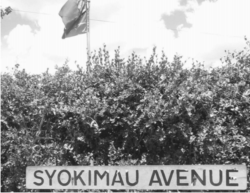
PHOTOGRAPH 1. A street in Machakos Town named after the Kamba prophet who is reputed to have predicted the arrival of the British in Kenya.