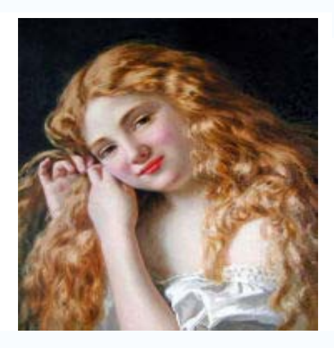
Young Girl Fixing her Hair, by Sophie Gengembre Anderson

Hair is a filamentous outgrowth of dead cells from the skin, found mainly in mammals.