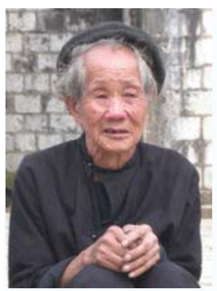
An older Hmong man with gray hair