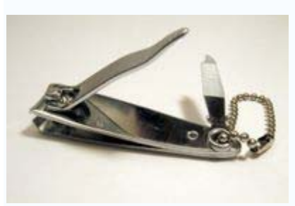
A lever type nail clipper with a file

A nail clipper or nail trimmer is a mechanical device used to trim fingernails and toenails. Nail clippers are usually made of metal. Two common varieties are the plier type and the lever type. Both are common household objects. Most nail clippers usually come with another tool attached, which is used to clean the dirt out of nails. A nail trimmer often has a miniature file fixed to it to allow rough edges of nails to be manicured. Nail clippers occasionally come with a pocket knife or a nail catcher. The nail trimmer consists of a head which may be concave or convex. Specialized nail trimmers which have convex clipping ends are intended for trimming toenails, while concave clipping ends are for fingernails. The cutting head may be manufactured to be parallel or perpendicular to the principal axis of the clipper. Cutting heads which are parallel to the principal axis are made to address accessibility issues involved with cutting toenails.