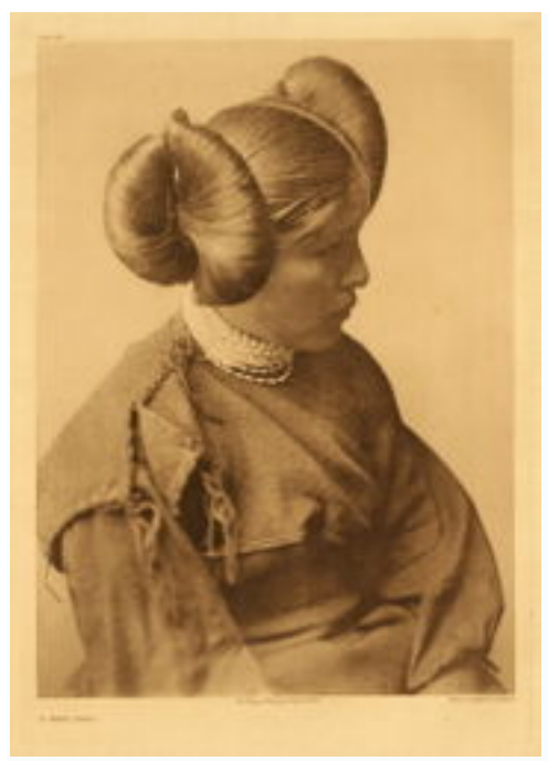
Traditional Hopi hair style

Humans have three different types of hair: