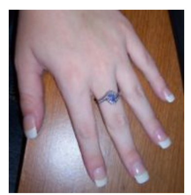
Example of a French Manicure

A manicure is a cosmetic beauty treatment for the fingernails and hands enjoyed by both sexes. A manicure can treat just the hands, just the nails, or both. A standard manicure usually includes filing and shaping of the nails and the application of polish. Some speciality manicures, such as the French Manicure, may also be offered. Treatments for hands usually include soaking in a softening substance and application of hand lotion. A