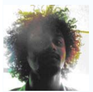
A person with extremely curly hair

Hair texture is measured by the degree of which one's hair is either fine or coarse, which in turn varies according to the diameter of each individual hair. There are usually four major types of hair texture: fine , medium , coarse and wiry . Within the four texture ranges hair can also be thin, medium or thick density and it can be straight, curly, wavy or kinky. Hair conditioner will also alter the ultimate equation and can be healthy, normal, oily, dry, damaged or a combination. Also, an expert hairdresser can change the hair texture with the use of special chemicals.