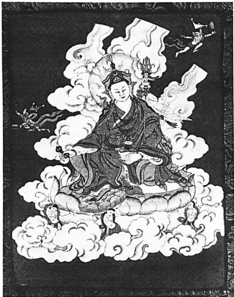
VISION OF GURU RINPOCHE