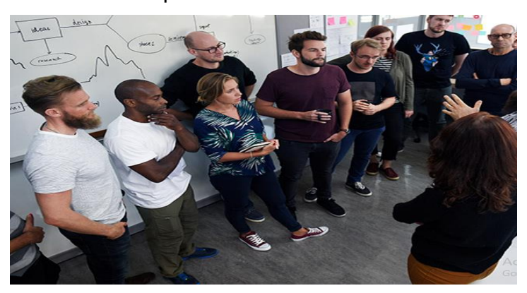
Fig 5.1 New employees being given orientation