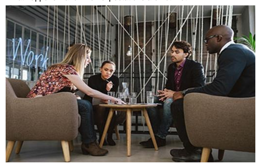
Fig 5.2 recruitment process undertaken in office