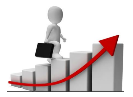
Figure 1: Effective Business growth

The key to implement and monitor identified improvements of work operations and to develop an excellent performance management model according to the company's objectives is to get constant feedback from your employees and customers for effectiveness.