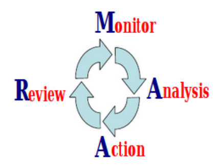
Fig 2. Continuous Improvement Cycle