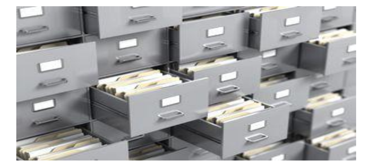
Figure 1: Filing Cabinet for hard copies

Only you know what your office is looking for, and only you can decide the best way for your practice to manage your legal documents. However, legal documents are carefully maintained and relevant records are kept and updated to ensure validity and accessibility