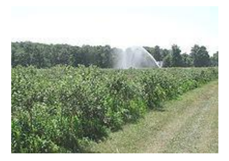
Fig. 3 Sprinkler irrigation

Better spray irrigation: By use of traditional spray irrigation, water basically is just shot through the air onto fields. A lot of the water sprayed evaporates or blows away before it hits the ground. Another method, where water is gently sprayed from a hanging pipe uses water more efficiently. This method increases irrigation efficiency from about 60 percent (traditional spray irrigation) to over 90 percent. Plus, less electricity is needed.