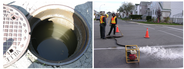
Figure 1. Flooded air-vacuum valve vault.

where Q_i = intrusion flow; C_d = coefficient of discharge; D = orifice diameter; g = gravitational acceleration; H_{\text{ext}} = external head on pipe; and H_{\text{int}} = internal line pressure. For intrusion using a leakage rate, the intrusion flow at a node is computed when the external head value (head of water above pipe – which is fixed by the user) is above the internal pipe pressure value. The leakage factor is used to set the size of the orifice. A leakage value of 20% was simulated along with an exit (or external) head of 1.4 m (2 psi). When computing intrusion volumes through pipe leaks, it was assumed that none of the air-vacuum valves were submerged and these were modeled as surge protection devices. In the model, as their actual sizes were unknown, the air-vacuum valves were sized using the AWWA rule of thumb, which recommends a 25 mm inlet size per 300 mm of pipe diameter (AWWA, 2004). Resulting inlet diameters of 25, 50, and 75 mm were obtained. For simulating intrusion through submerged air-vacuum valves, all air-vacuum valves located in the network studied area ( n = 30 ) were assumed to be submerged under 0.5 m of water in the vault. A flooded vault is illustrated in Fig. 1.