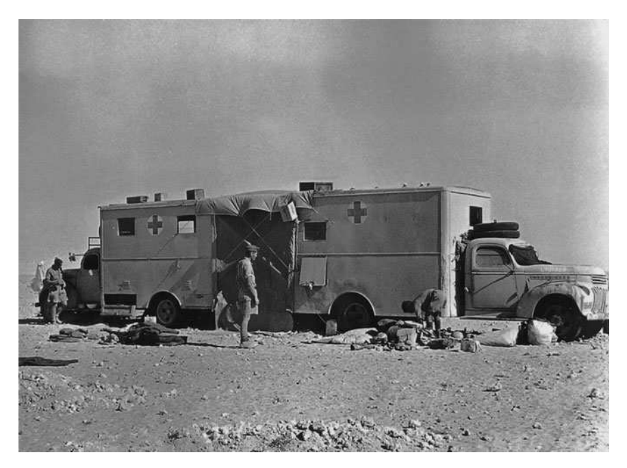
3. Mobile Operating Theatre, Middle East Theatre, CMAC RAMC 801/22/31

Transfusion was essential to effective surgery in wartime, since all previous attempts to maintain blood volume using substitutes like saline solution and gum acacia had proved disappointing. The experiences of the First World War had shown that blood transfusion was the only truly effective method of treating cases of profound shock, and that saline and other non-blood solutions were useful for maintaining blood pressure in only the mildest cases. Ordinary saline solution could not, for example, prevent acidosis or 'air hunger'—a condition that develops in cases of low blood pressure, causing shortage of oxygen.<sup>152</sup> Thanks to the work of Walter B. Cannon and