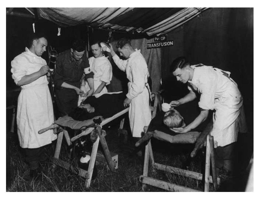
7. Blood transfusion at No. 13 FDS, Normandy, 1944, AMSM 2001: 62

6. Jeep ambulance crossing the Caen Canal, June 1944, CMAC RAMC 1637/6