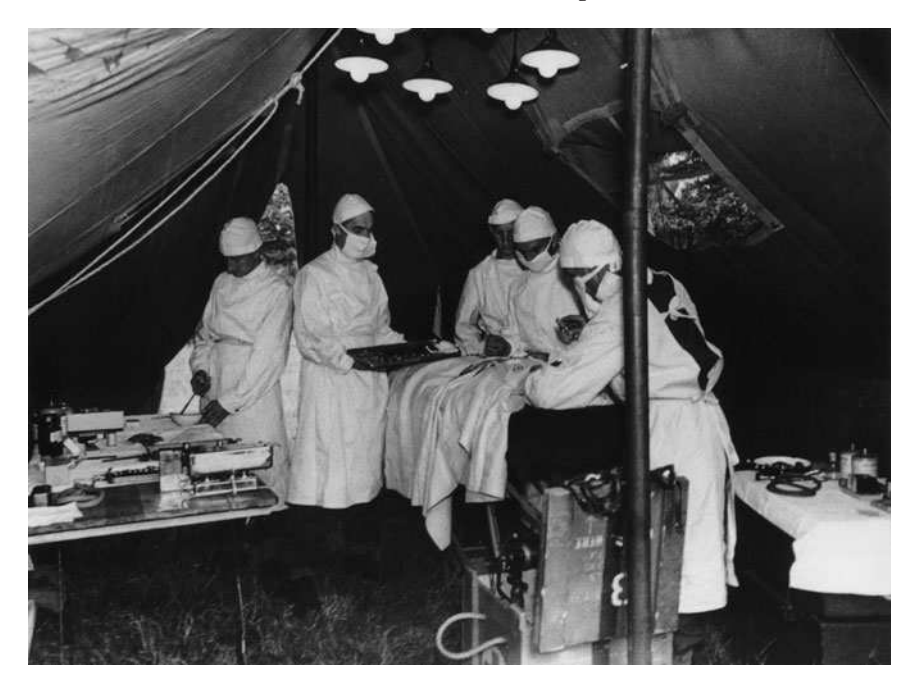
8. Surgery in No. 13 FDS, Normandy, 1944, AMSM 2001: 62

brigades of 8<sup>th</sup> Corps plus three others. After three days of heavy fighting the Germans managed to halt the offensive, establishing a formidable anti-tank screen east of the Orne. By the time Montgomery had called off the attack, on 20 July, the British had lost 4,000 men and 500 tanks; yet German forces had been contained, leaving the way free for the sweeping advance of the Allied armies.