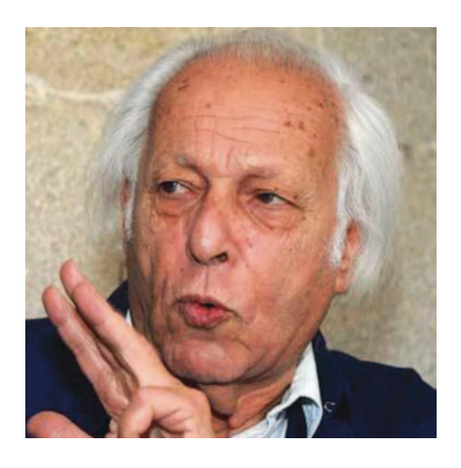
Samir Amin.