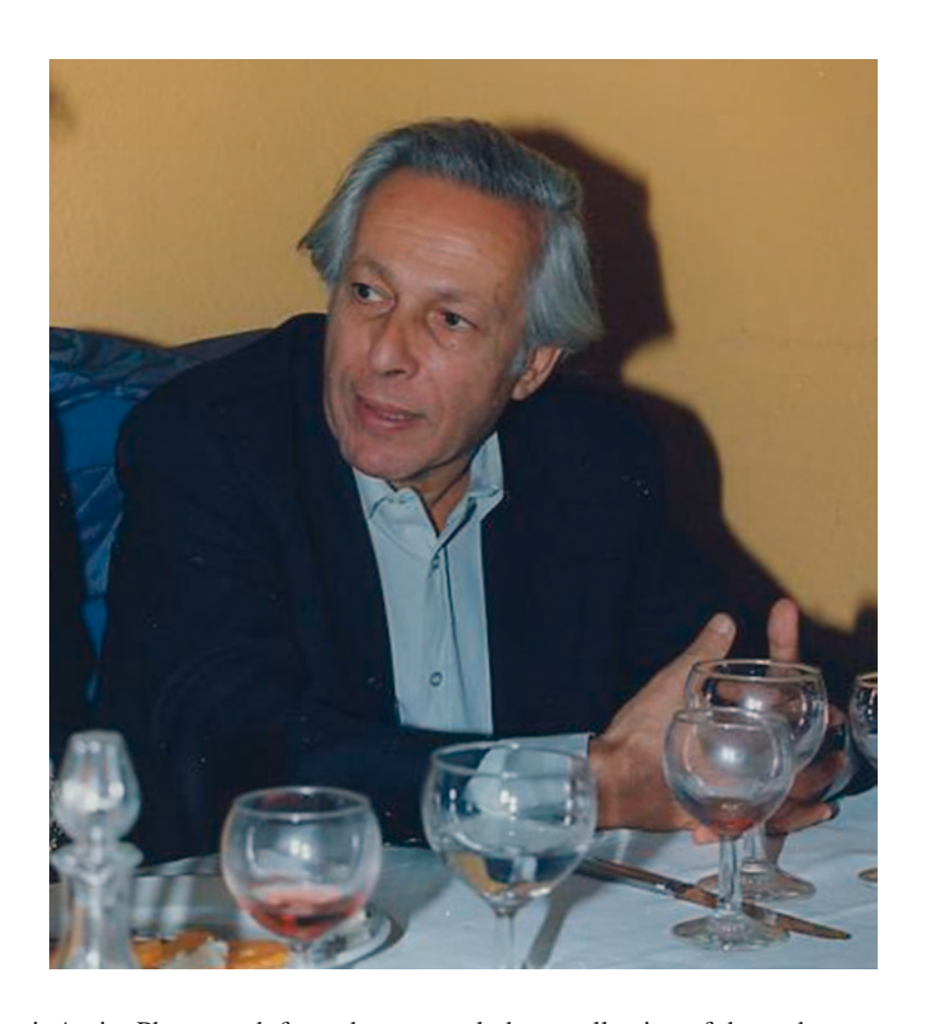
Samir Amin.