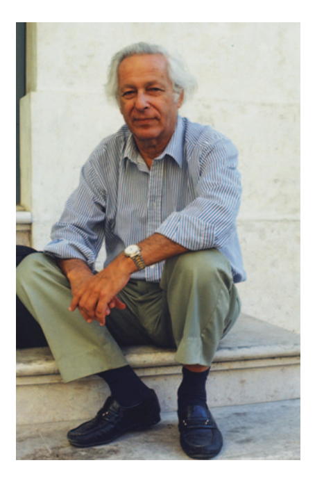
Photo of Samir Amin (Egypt) as the Ibn Rushd Prize Winner for Freedom of Thought (2009).