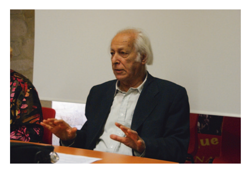
Samir Amin.

"development" as it was understood by conventional economists in the early 1960s, and especially to disputing the dominant discourse on why the development of countries of the South, and Africa in particular, were lagging behind. A core aspect of Samir Amin's work, since his PhD thesis, was to demonstrate the indissoluble link between 'development' and 'underdevelopment'.