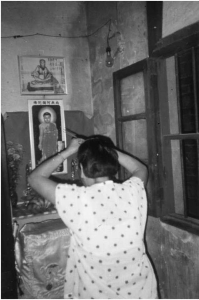
Figure 2 Image of Master Wuji being venerated inside the home of a devotee in Fujian, 1997.

mummy began to spread throughout the area. One striking example of this renewed piety is the spread of photocopy reproductions of the picture of the Wuji mummy (that was taken in Japan at the Taishō hakuran kai exhibition) that have been propagated widely and even found their way onto the altars (in the highest position of honour no less) in people's homes throughout the village.