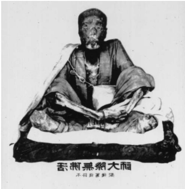
Figure 1 The 'Living Buddha' Master Wuji on display at the Taishō Exhibition in 1916.

sponsored a number of special viewings [ kaichō ] of the mummy throughout Japan. 22 Later, responsibilities for administration of the 'Association for the Reverence of Master [Wuji]' were taken over by Hirano and Yamazaki and they moved the mummy to Aoume, where the Mt. Sekitō Temple was eventually founded.