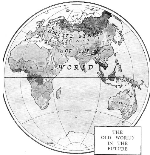
Figure 10.1 'The Next Stage' 36

The various editions of world histories remind us that there was and is no universal reader of world histories. While the authors of world histories offered advice or even prescribed a manner and order of reading, the different forms and contexts in which their works appeared fostered multiple readings. This relationship between authors, publishers and readers – sometimes cohesive, sometimes conflicting – continues today. The producers of world history texts – print and electronic – face pressures from publishers about word length, the use of illustrations, supporting websites, CD ROMs and footnotes. A writer might have in mind a long, careful, well-referenced study but be required to modify it to better capture key markets, that is, first-year undergraduates. Similarly, a student might prefer to read comic strips but find that none of their university texts take that form. Readers and writers may not always feel that they get what they want, but the variety of publishing firms and publication media at least ensures that there is no single vision of what world history is or might be.