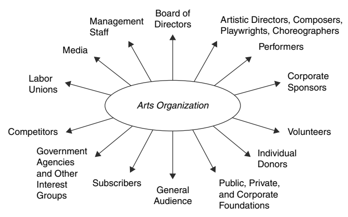
Exhibit 5.1 An arts organization's publics.

Publics are individuals, groups, and organizations that take an interest in the organization. Various publics can help or harm the organization at different