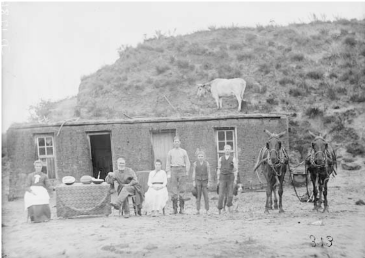
Illustration 3 Pioneers in the 'American West'. A family of 'homesteaders' on the northern plains pose for a photo in front of their new home (called a 'sod house') in Custer County, Nebraska.