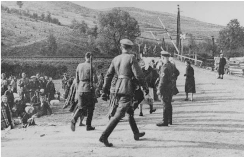
Illustration 6 Forced 'removal' in the 'Nazi East'. German police and SS personnel oversee the forced 'removal' and forced 'resettlement' of Poles from their homes in Sol, Katowice, Poland, to an internment camp.