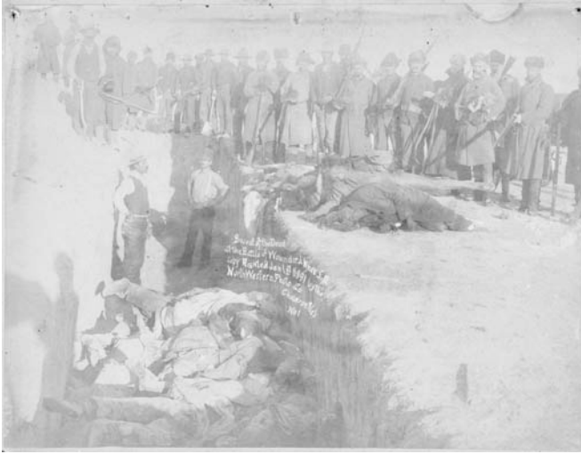
Illustration 9 Mass shooting in the 'American West'. Sioux Indian civilians shot by the US Army Seventh Cavalry during the 1890 Wounded Knee massacre in South Dakota are buried in a mass grave.