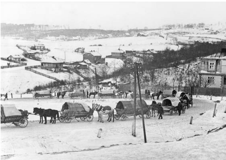
Illustration 2 Covered wagons headed 'east'. A covered 'waggon convoy' of German 'settlers' stops to rest before resuming their journey to a new life in the Nazi 'eastern empire'.

Source: Nebraska State Historical Society, photograph # RG1764-3.