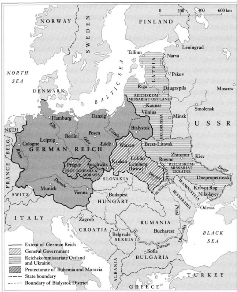
Map 2 Conquest and expansion in the 'Nazi East'. This map shows Hitler's Lebensraum empire in 'the East' at its zenith (that is, at the end of 1941).

Source: David Blackbourn, The Conquest of Nature: Water, Landscape, and the Making of Modern Germany (New York: W. W. Norton, 2006), p. 276.