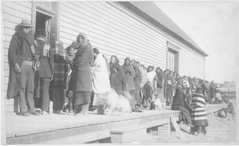
Illustration 7 Attrition in the 'American West'. Indians line up to receive their often inadequate food rations on 'ration day' at the Pine Ridge Agency Reservation in South Dakota.