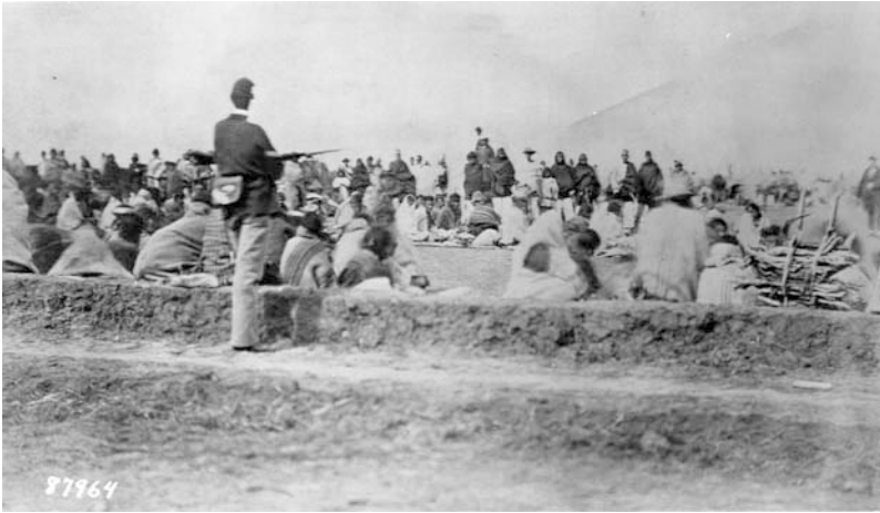
Illustration 5 Forced 'removal' in the 'American West'. US Army troops oversee a group of Navajo Indians who have been forcibly 'removed' from their homes and 'force-marched' to a military reservation at Fort Sumner, New Mexico.