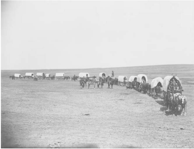
Illustration 1 Covered wagons headed 'west'. A 'wagon train' of American 'settlers' heads 'west' across the northern plains to seek their individual 'manifest destinies' in America's 'western empire'.