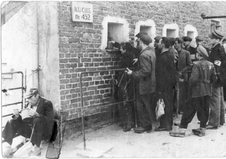
Illustration 8 Attrition in the 'Nazi East'. Jews in the Lodz Ghetto (Poland) wait outside Kitchen #452 to receive their meagre food rations.