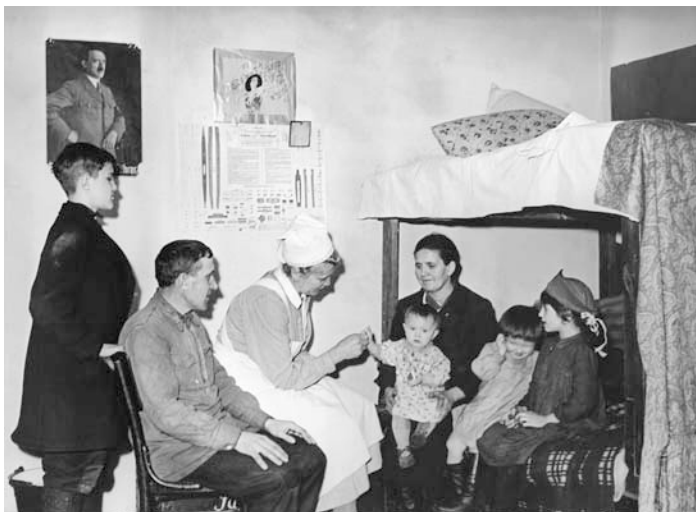
Illustration 4 Pioneers in the 'Nazi East'. In the Reichsgau Wartheland (areas of western Poland annexed by Nazi Germany), a 'settler' family is visited by a nurse from the National Socialist Volunteers (NSV).