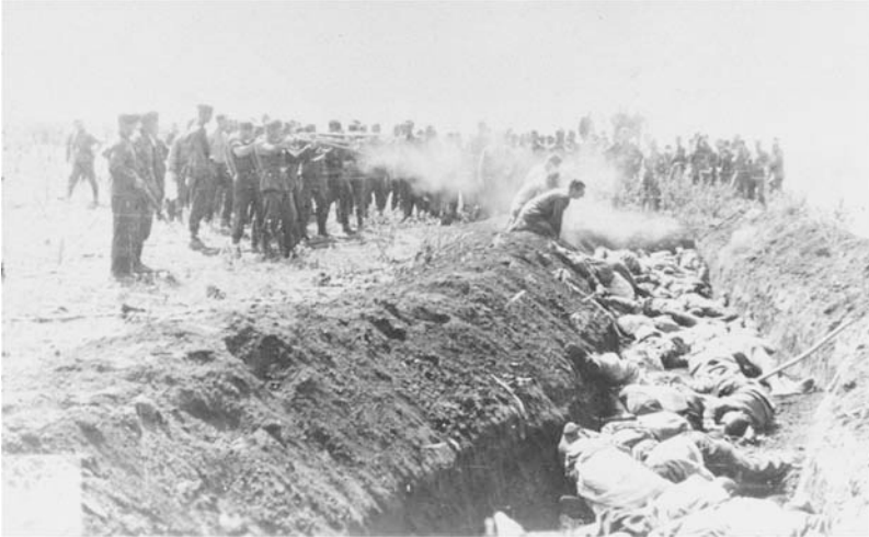
Illustration 10 Mass shooting in the 'Nazi East'. Men from an unidentified unit of an Einsatzgruppen mobile killing squad execute a group of Soviet civilians kneeling by the side of a mass grave.