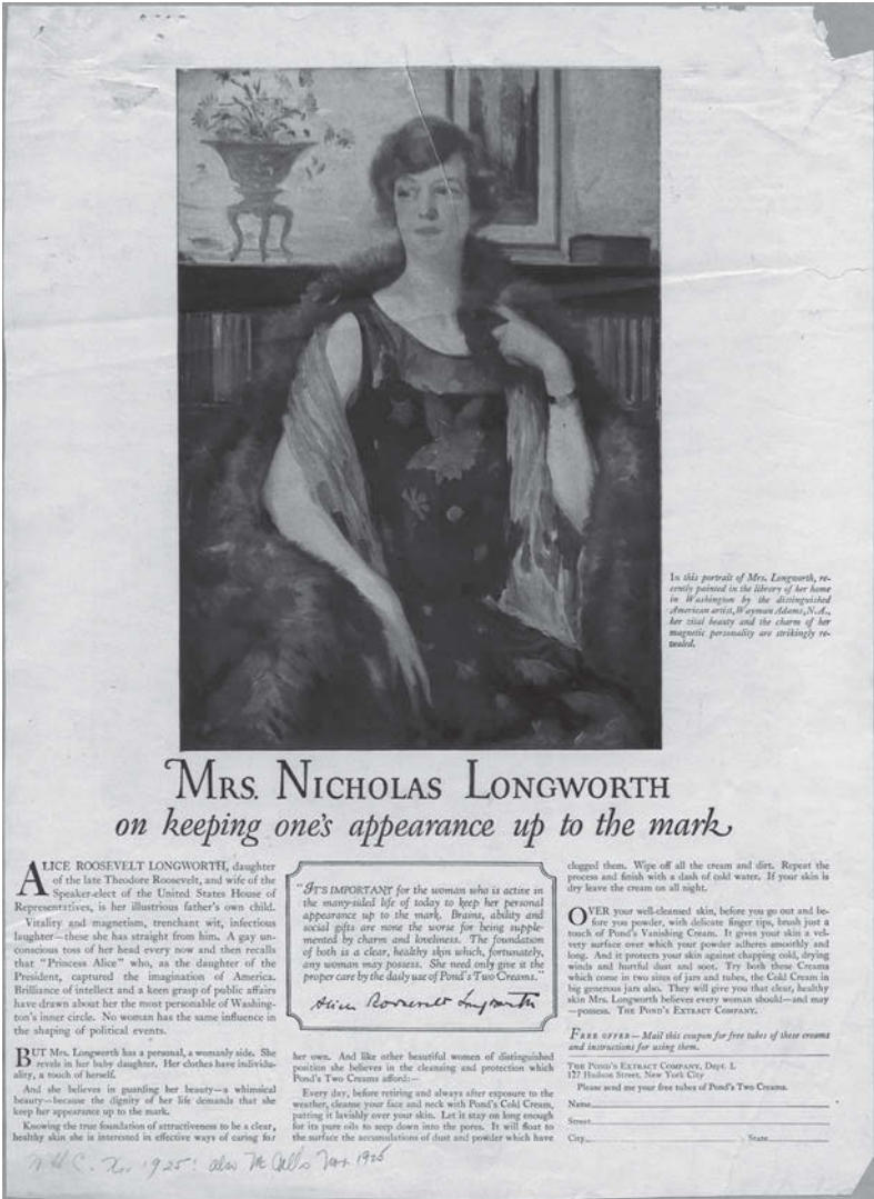
Figure 3.1. Pond's, "Mrs. Nicholas Longworth"

signed for Pond's: H. R. H. Henriette; Duchesse of Vendome; Princesse of Belgium; Her Highness Princess Eugene Murat; the Duchesse de Guise; the Duchesse de Gramont; the Duquesa de Alba; and the Duchess of Marlborough. 41 Thus, Britain and Continental Europe were represented by minor nobility—names that would have been somewhat exotic to