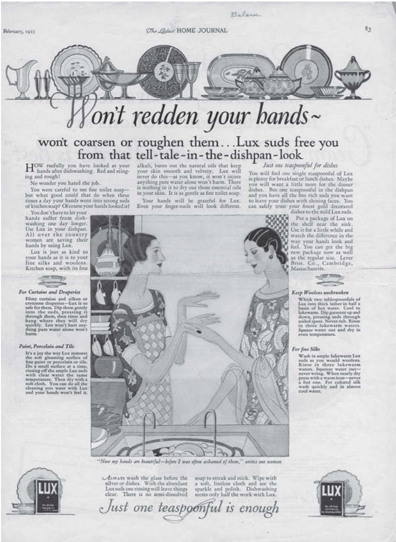
Figure 2.4. Lux, "Won't Redden Your Hands"

Life and Parenting Magazines; and testimonials from farm women were sent for publication in Master Farm Homemakers . 34