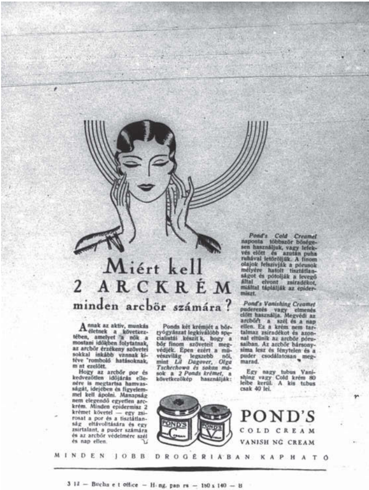
Figure 6.2. Pond's, "Why Does Every Complexion Need Two Face Creams?"

experts so that the fine tissues of your skin are protected. This is why the most beautiful women in the artistic world, such as Lil Dagover and Olga Tschekowa and many others use the two Pond's creams .” 30 Instead of using a royal society endorser, this ad uses the allure of actresses.