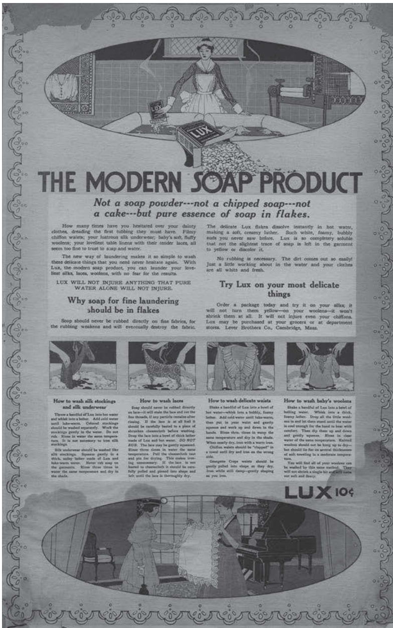
Figure 2.2. Lux, "The Modern Soap Product"