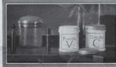
EVERY SKIN NEEDS THESE TWO CREAMS