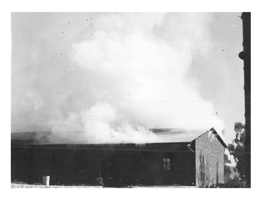
A Building on Fire, June 1976 NAR: Photograph, SAB K345