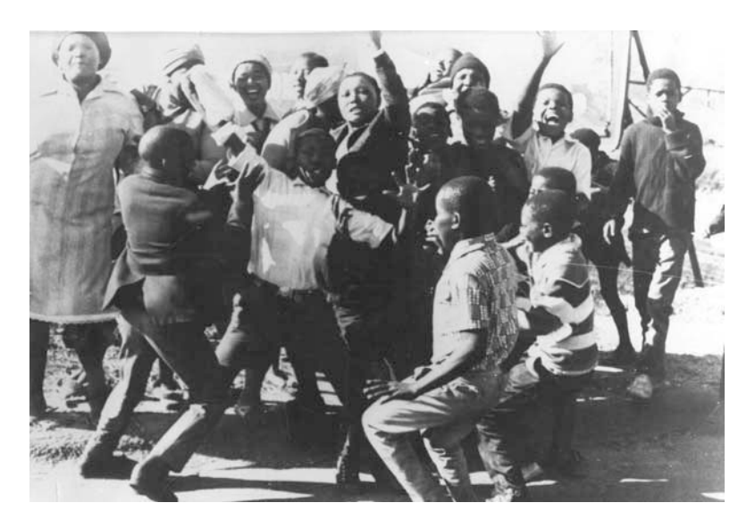
Children of Alexandra, June 1976