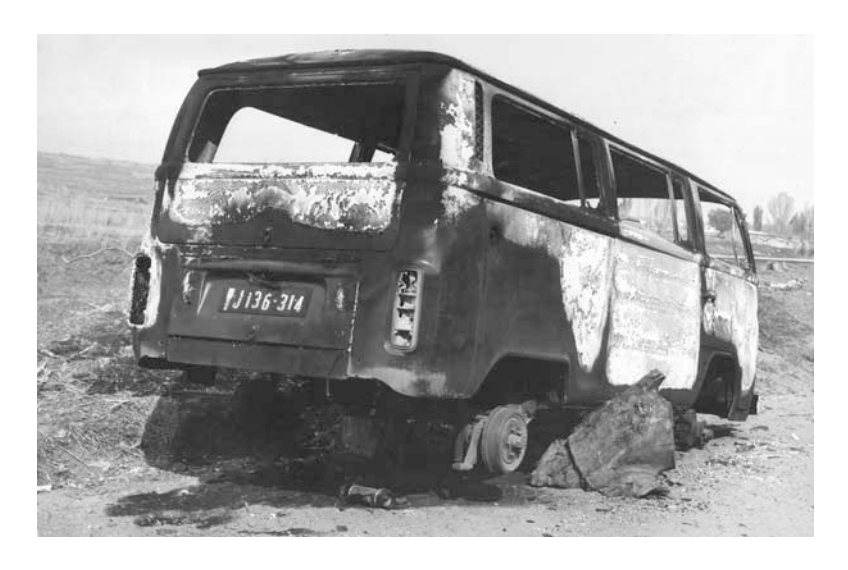
"A Kombi Destroyed by Fire," June 1976