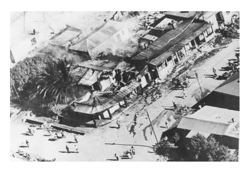
Aerial View of Destruction, June 1976, NAR: Photograph, SAB K345