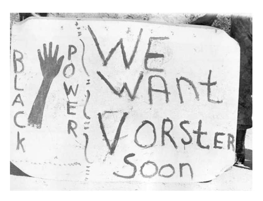
"We Want Vorster," June 1976, NAR: Photograph, SAB K345