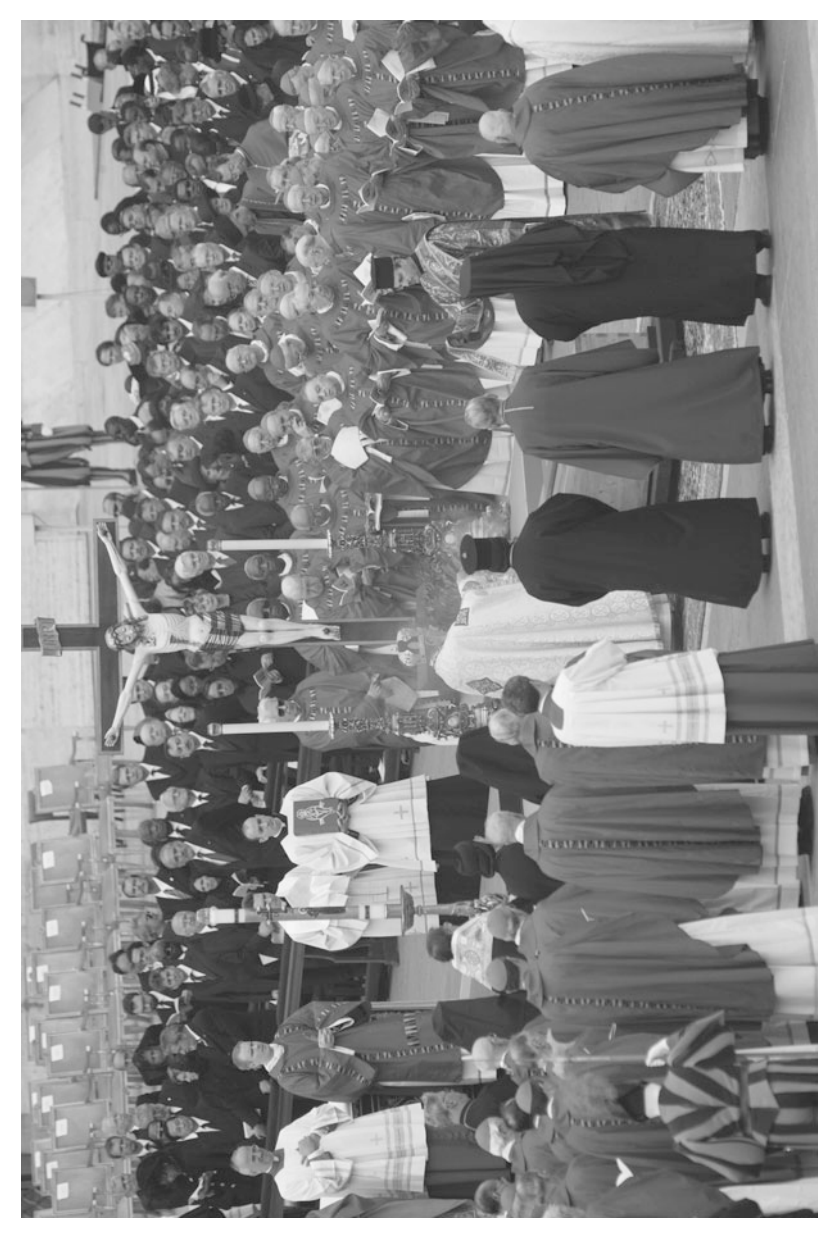
Figure 1 The patriarchs of the Eastern Catholic Churches performing funeral rites for Pope John Paul II