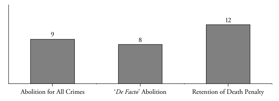
Figure 1: Status of the Death Penalty in 29 Asian Jurisdictions as of December 2011 Note: The jurisdictions are as follows. Abolition for all crimes: Hong Kong (1993), Macao (1995), Australia (1985), New Zealand (1989), Bhutan (2004), Cambodia (1989), East Timor (1999), Nepal (1997), and the Philippines (2006). 'De facto' abolition: Brunei Darussalam (last execution in 1957), Laos (1989), Maldives (1952), Mongolia (2008), Myanmar (1989), Papua New Guinea (1950), South Korea (1997), and Sri Lanka (1976). Retention: China, Japan, North Korea, Taiwan, Bangladesh, Pakistan, Indonesia, Malaysia, Singapore, Thailand, Vietnam, and India. Note, too, that the 'Special Administrative Regions' of Hong Kong and Macao do not have capital punishment, but offenders can be executed in China through the process of 'rendition'.