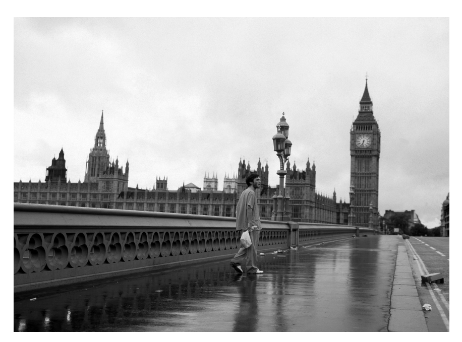
Figure 7.1 Westminster Bridge, from 28 Days Later (Danny Boyle, United Kingdom, 2002), © 20th Century Fox/Photofest.

As with Crowe's treatment of Times Square, my interest in Boyle's cinematic vision of the city derives from its uncanniness—from what Nicholas Royle (2003), adapting Freud, describes in terms of "a peculiar commingling of the familiar and the unfamiliar" resulting in "a sense of homeliness uprooted" (1). First, it is worth noting that, from a production point of view, the empty London scene from 28 Days Later is even more remarkable than the empty Times Square scene in Vanilla Sky, since here as well no computer-generated images were used to create the visual effect of emptiness. And yet, the scene covers a significantly larger geographic area of the city. Shot throughout central London during the early morning hours,