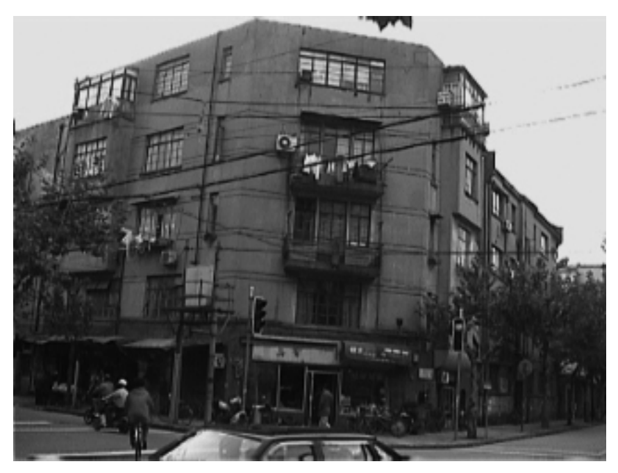
Figure 11.1 Kofman Mansions Hunan lu (previously Ferguson Road), Shanghai 2000, courtesy Andrew Jakubowicz.

The ideal of cosmopolitanism, to quote a much-discussed essay of Ulf Hannerz's (Hannerz 1990: 239), as "an orientation, a willingness to engage with the other [...] an intellectual and aesthetic stance of openness toward divergent cultural experiences" may be an admirable one, but it is sustainable only in metropolitan centers where movement and travel are undertaken with ease and where the encounter with other cultures is a matter of free choice, negotiated on favourable terms. (771)