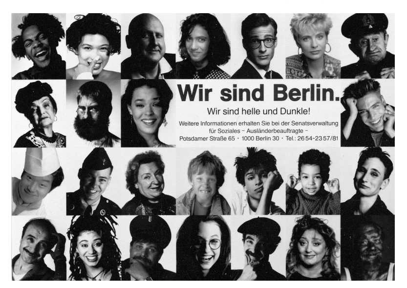
Figure 3.1 'Wir sind Berlin' [We are Berlin] poster, courtesy of the Commissioner for Integration and Migration of the Senate of Berlin.

The main intention of this multicultural branding effort was to include immigrants and those targeted by the "foreigner" label in the symbolic construction of an urban community. No particular claims were made regarding the relationship between distinct ethnic groups; the orderly grid of neatly spaced portraits represented the idea that intercultural harmony could best be achieved by giving everyone equal space and place in the multicultural city.