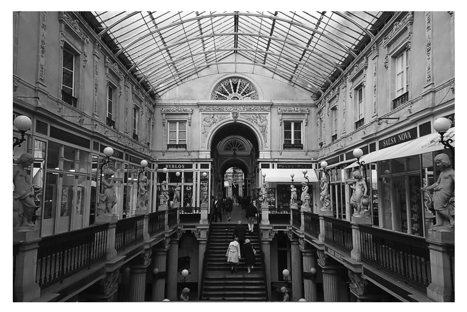
Figure 9.1 Passage Pommeraye, Nantes, France, © Erick Martineau.

An early representation of the passage in travel writing by Gustave Flaubert is eloquent and economical on the sensory seductions of shopping, looking, and touching as well as dreaming; all the more so in that these coexist oxymoronically with the emptiness of the pure exchange value they represent as they circulate. These processes, it is clear, are bound up with the world "beyond the seas," the bringing of the world to Nantes, and to this special microcosmic space (Flaubert 51). In Demy, the phantasmagoric and virtual possibilities of the passage contain a dark side. Lola's suitor Cassard (Marc Michel) enters there a sinister hairdresser's shop, into a backroom past curling tongues and hairdryers that look like instruments of torture, and is drawn into a diamond-smuggling plot. The kids in Jacquot de Nantes speculate about a white slave trade going on in a lingerie shop. In Une Chambre en ville, unfaithful wife Edith (Dominique Sanda) twice visits at night her ogre-like husband in his lair there, a struggling television shop that produces a murky, aquatic light; he flushes her keys down the toilet before slitting his throat, she literally has to break out, or up, through a skylight.