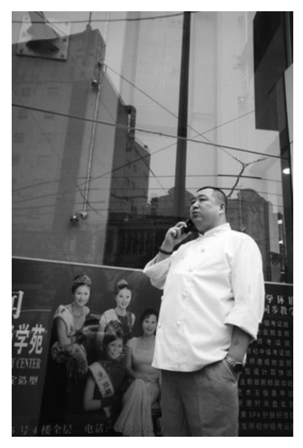
Frontispiece. Man on phone in a Shanghai street, 2008