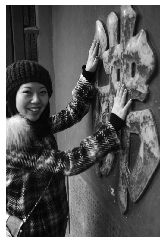
Figure 12.1 Chengdu, Sichuan 2008, a stylish tradition, courtesy Leicia Petersen.

This chapter addresses the constitutive relationship between the cosmopolitan ( yang ) and the provincial (tu) in the fashioning of a modern Chinese urbanity. It understands fashion change as "communicative" and "institutional" (Barthes 2006), thus intimately and broadly social: located in sartorial and other material details as well as changing ideas and practices of cultural urbanity. It examines these changes as they are figured in modern and contemporary Chinese city narratives in terms of the multidirectional