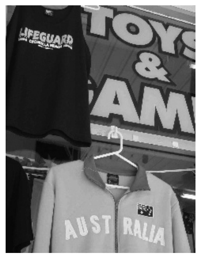
Figure 13.1 Selling Australia in Cronulla 2007.

How are we to interpret the fact that the events at Cronulla happened at a time when we are supposedly more cosmopolitan than ever before,