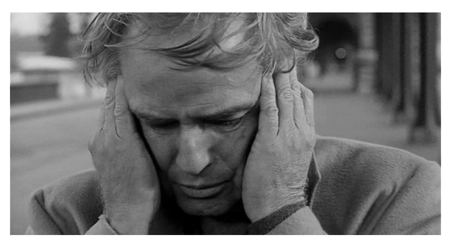
Figure 8.2 Marlon Brando on the Pont du Bir-Hakeim, from Last Tango in Paris (Bernardo Bertolucci, US/France, 1972), © 1972 Metro-Goldwyn-Mayer Studios Inc. All Rights Reserved. Courtesy of MGM CLIP+STILL.

In the opening sequence, we see Paul screaming in anguish in a very specific place that has had a significant, multilayered, and ideologically variable role in the modern history of Paris (see Figure 8.2): the Pont de Bir-Hakeim, an official historic monument of the city, first built in 1878 as a pedestrian bridge, and known as the Passerelle de Passy, but redeveloped as a result of the 1900 Exposition Universelle with a then state-of-the-art iron and steel two-tier construction to carry both a road and the new Paris Métro overhead (Lambert 1999: 226). The tiny island in the middle of the Seine, which the bridge traverses, the Allée des Cygnes, later became a key site