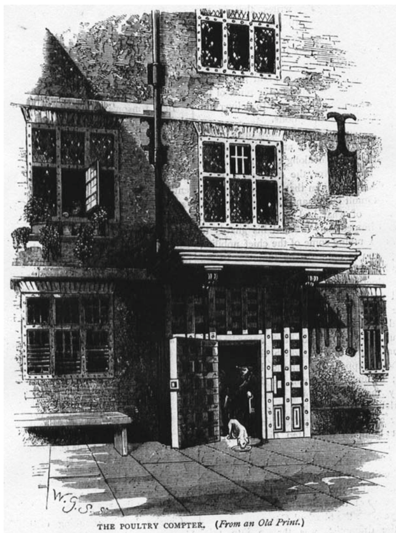
Figure 2.3 The Poultry compter, from an old print (from 'Old and New London' c.1875).

the metropolis given that the risk of fire spreading and consuming adjacent property was a very real one. 50 The detailed examination of this case and the way it is recorded shows that part of the function of the summary process was to prepare cases for trial at the higher courts. It is clear, therefore, that while some, if not many, of the hearings that