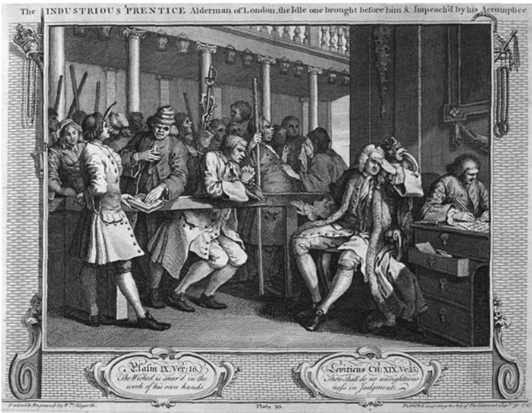
Figure 2.2 The Guildhall Justice Room, by William Hogarth 41

What form did the hearings before the magistrates take in this period? The scene in the Guildhall justice room is illustrated by Hogarth in Figure 2.2, as Jack Idle is brought before his more industrious former