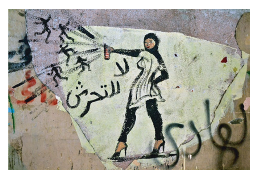
Fig. 7.4 "No to harassment" graffiti

Egyptian graffiti artists promoting female graffiti also include many men. One such artist, who goes by the name Zeft, created a stencil of Queen Nefertiti wearing a gas mask. The caption reads: "A woman's voice is revolution." This is in response to a common saying by Muslim conservatives that "A woman's voice is indecent/improper." Zeft circu-