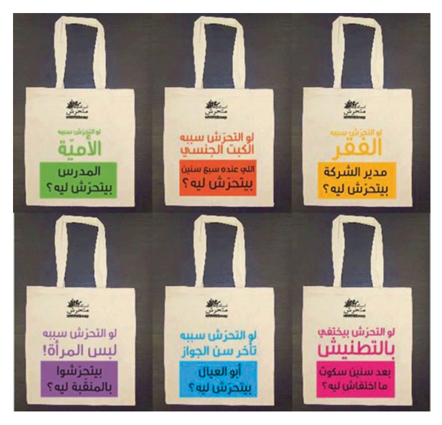
Fig. 7.2 HarassMap shopping bags campaign

HarassMap is a strong example of Egyptian female activists' empowerment via social media and technology. In their analysis of social media use in the Egyptian Arab Spring, Eltantawy and Wiest (2011) argue that most significant about the use of social media in the Egyptian revolution was how it changed social mobilization dynamics by infusing activism initiatives with speed and interactivity not witnessed in traditional mobilization. The same could be argued about Egyptian female activists who rely on social media and information technology to combat sexual harassment. These innovative tools enable sexual harassment activists to monitor developments in Egypt, join social networking groups, engage in discussions, and utilize technology to map harassers across the nation. Social