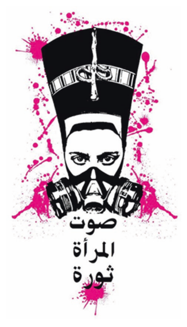
Fig. 7.5 Queen Nefertiti graffiti

lated his graffiti via social media, inviting the free download and use of his stencil as long as it was not for profit (El Zeft Facebook Page 2012) (Fig. 7.5).