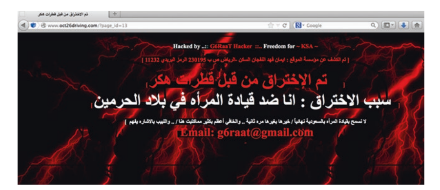
Fig. 8.1 Hacked website of http://www.oct26driving.com (www.oct26driving.com/?page_id=13www.oct26driving.com/?page_id=13)

A critical difference between the Oct26Driving and the Women2Drive campaigns was that three female Consultative Council members backed up the protesters. They filed a recommendation to the council on October 8, 2013 to lift the ban on women's driving, and they asked the council to