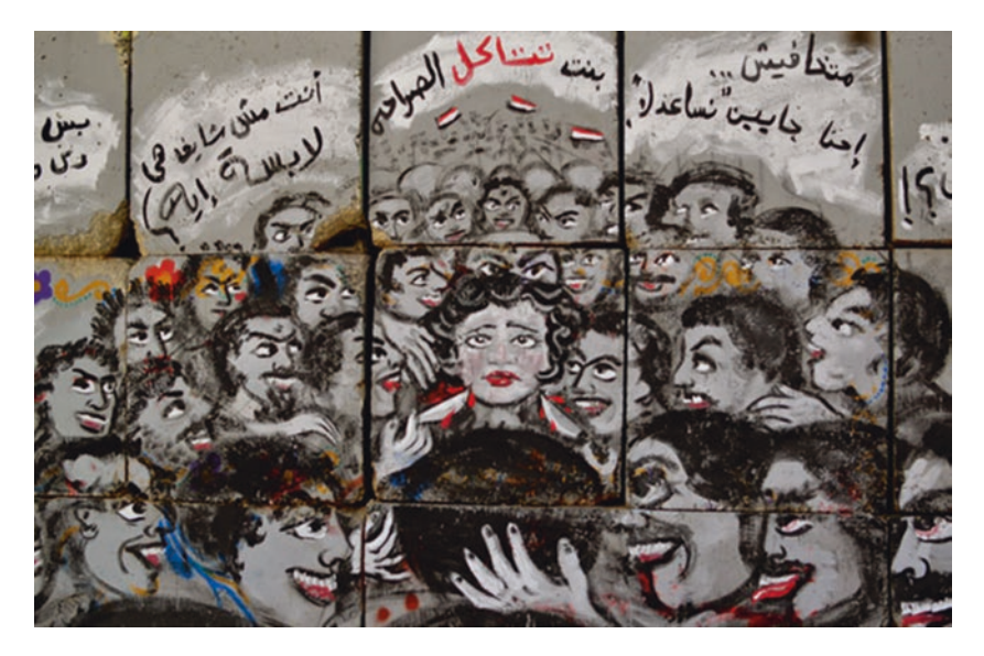
Fig. 7.3 "The Circle of Hell" graffiti

A wall close to Tahrir Square displays a mural titled "The Circle of Hell," where a woman stands terrified, surrounded by a mob of men with hungry eyes who loom around her, yelling out remarks about her appearance. Artists Mira Shihadeh and Zeft drew this graffiti to denounce the growing trend of violent mob attacks on women in Tahrir and elsewhere, where girls are "encircled in mobs of 200 to 300 men who fight, pull, shove, beat and strip them" (Patry 2013) (Fig. 7.3).