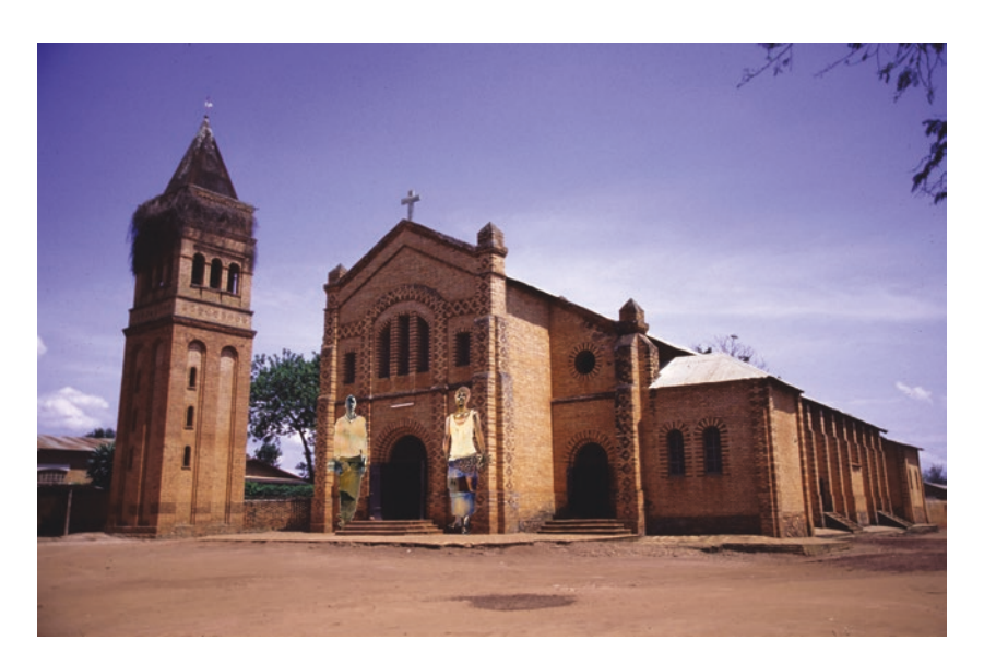
Fig. 15.2 'Upright Men'

cities in all hosted the project, as well as Kigali. The international community was able to pay homage in different ways with the backdrop of 'Upright Men,' remembering their own implication (or not) in the events that led to the Tutsi genocide in Rwanda, reflecting on the mechanisms, complicity, and notions of justice for the victims. When there was no possibility to paint directly on buildings, other types of representation of 'Upright Men' were created: large scale printed images on cloth sheets hung in different places, or light projections of these same figures on building façades, for example, as was done on the Lausanne Cathedral or on historical buildings in Ouida (Fig. 15.2).