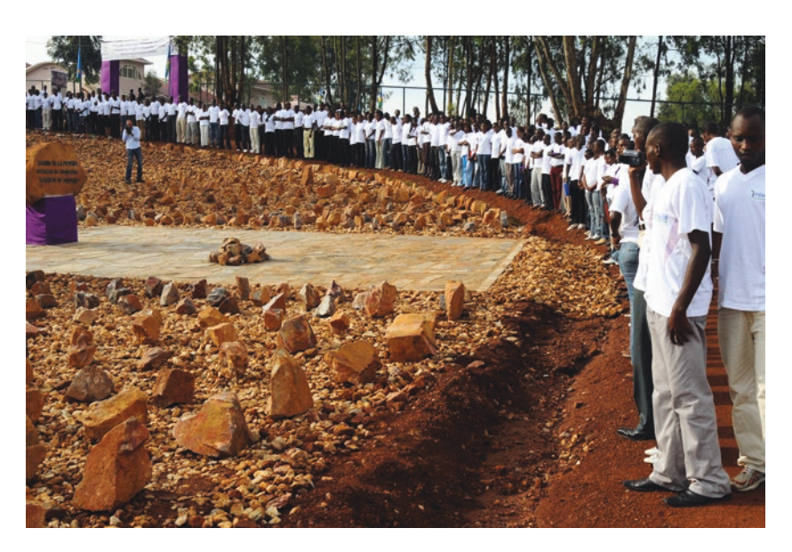
Fig. 15.1 'The Garden of Memory'

Anonymous stones are given the identity of the victims, a marker for memory—individual and collective remembrance of victims (Fig. 15.1).