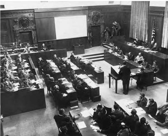
2. The Nuremberg Court