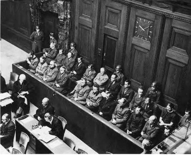
1. The Accused