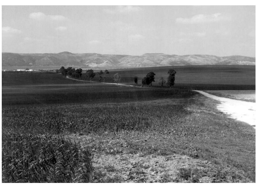
Wheat fields of a wealthy farmer.