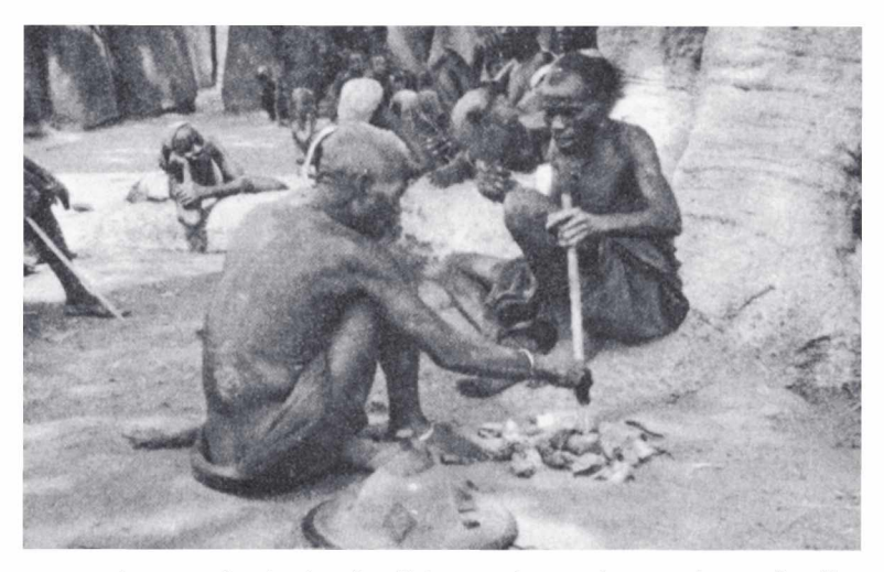
Figure 2b. Second episode: the diviner and consultor work out the diagnosis of the situation.