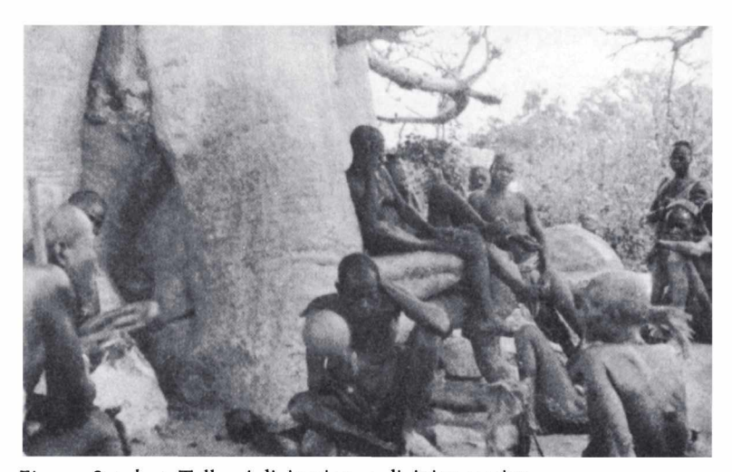
Figures 2 a, b, c. Tallensi divination: a divining session. Figure 2a. First episode: the diviner summons his divining ancestors.