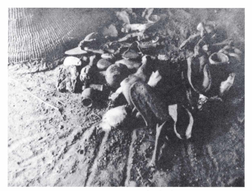
Figure 1. Tallensi divination: a collection of code objects.