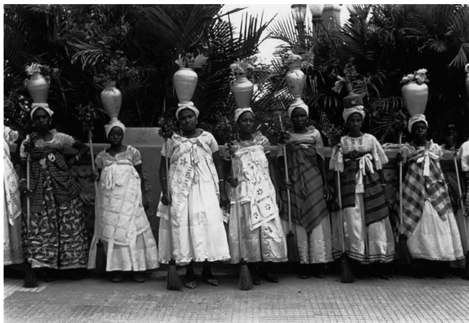
13. A Festa da Lavagem do Bonfim, Bahia, 1939.