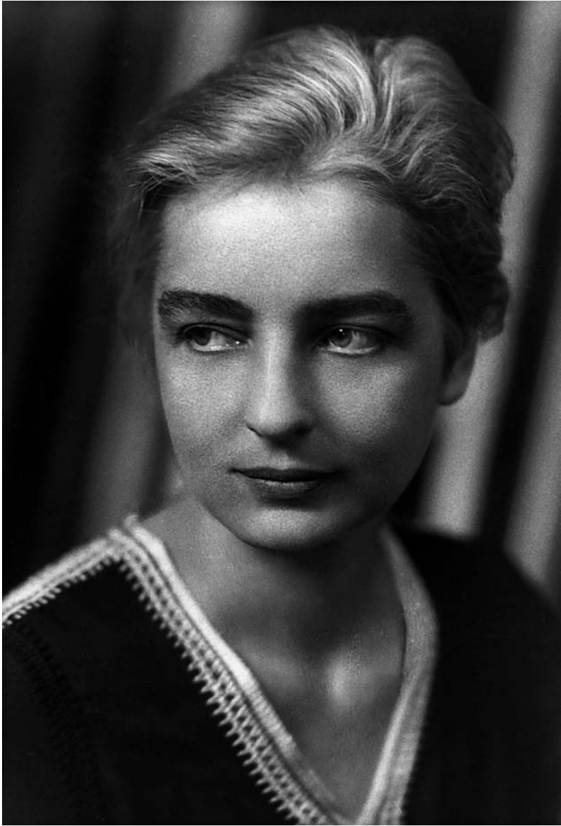
7. Ruth Benedict, 1930.