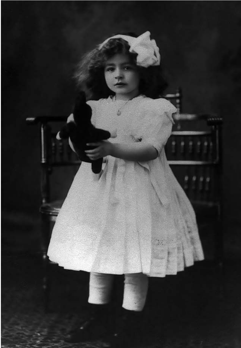
1. Ruth Landes, 1912.