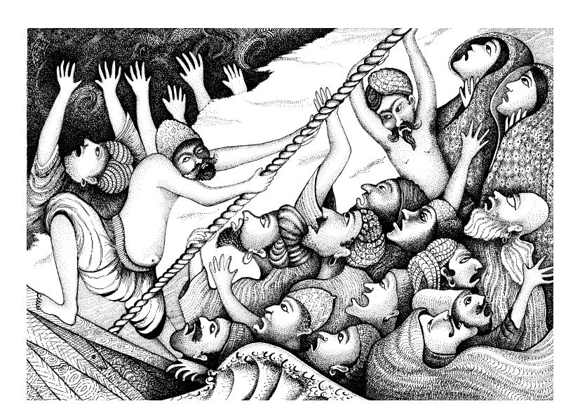
Figure 4 Shipwreck.

Al Khemir explains her style: "Not unlike photography, the style of drawing itself, based mainly on the dot, is interesting for me in its relation to the particle, the basic component of the universe, and to dust which is the ultimate destiny of everything" (Lloyd 2001: 195). Essentially, there is no difference between the words "dispersed by time" made out of grains of sand in al Khemir's Channel Four documentary and the drawings of The Island of Animals . Both reveal the desire for wholeness and betray the conviction of dispersion, painstaking efforts to hold dots together, and painful realisation, as one does this, that the whole is dispersible – an apt metaphor for communal existence of Diaspora. The visibility of the dot on the page betrays fragility. It also makes visible the process of drawing. It lays bare to the naked eye the artist's work: there is no attempt at mimesis or at conveying