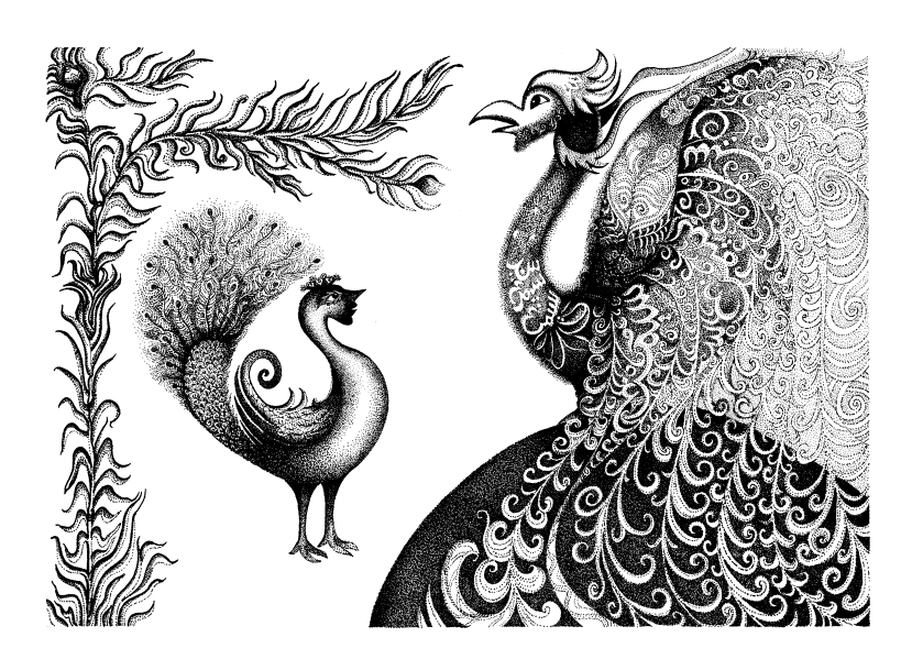
Figure 1 The Simurgh.