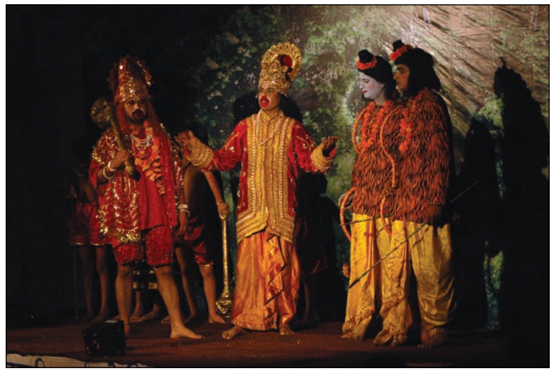
5. Ramlila performance (Courtesy: Bhumesh Bharti).