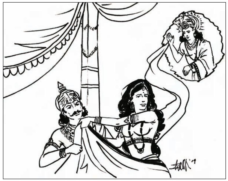
6. Draupadi's chirharan in the Mahābhārata and the benevolence of Krishna.