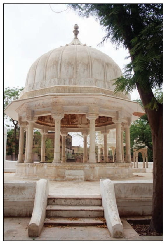
8. A dome depicting the Rāmāyana in Shekhawati region.