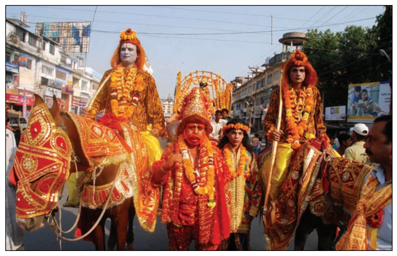
4. After the victory: Rama and Lakshmana return to Ayodhya—a Ramlila procession.