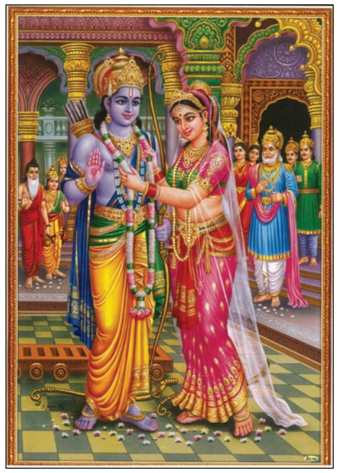
1. Sita's swayamvara-Rama wins her hand (Courtesy: Street Art).