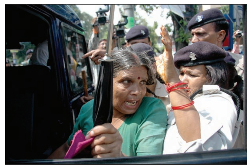
22. The arm of law and the protestor's self-defence (Courtesy: Renuka Pamecha).