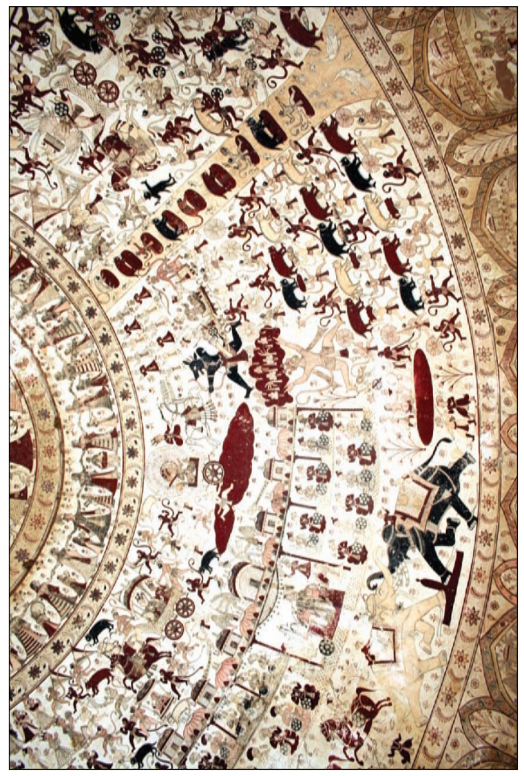
9. Continued histories of the Rāmāyana: Worshipping through art (Courtesy: Molina).