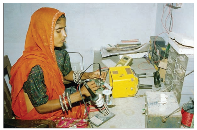
19. Empowerment: From illiteracy to technology.