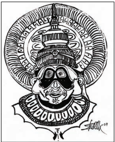
7. Kathakali mask (Courtesy: Shabbir).