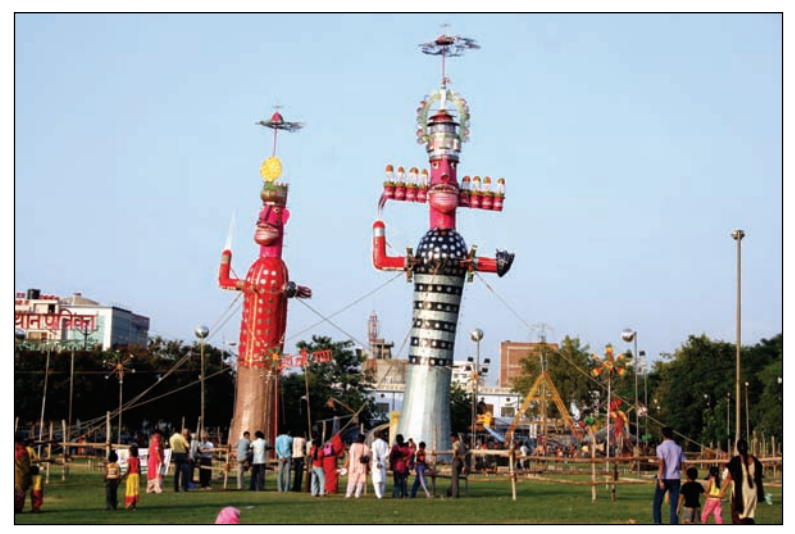
2. Celebrating the destruction of evil: A view of the Dussehra festival.