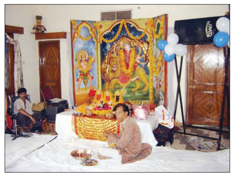
13. Worshipping Mata Vaishno Devi amidst domestic bliss.