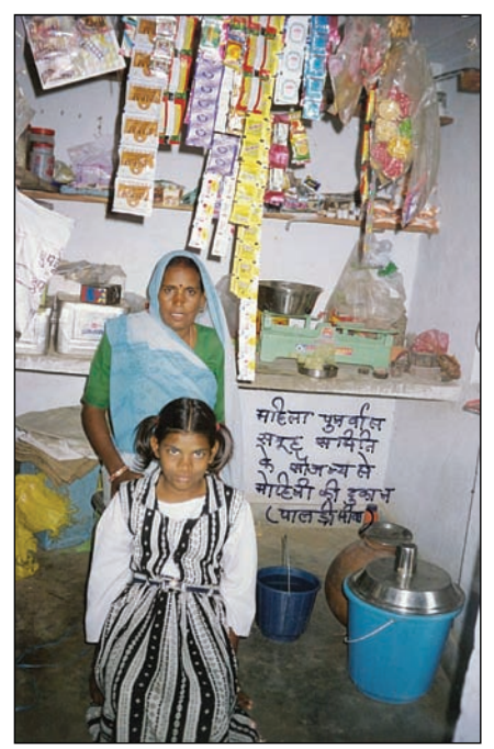
17. Setting up shop with the support of a Self Help Group.