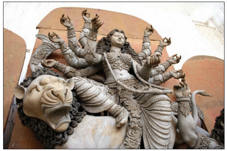
12. Durga Mata in all her glory.