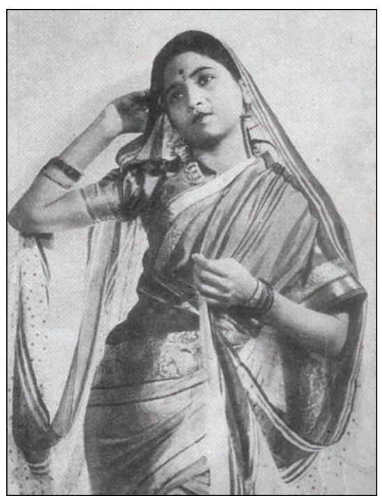
14. Hansa Wadkar.