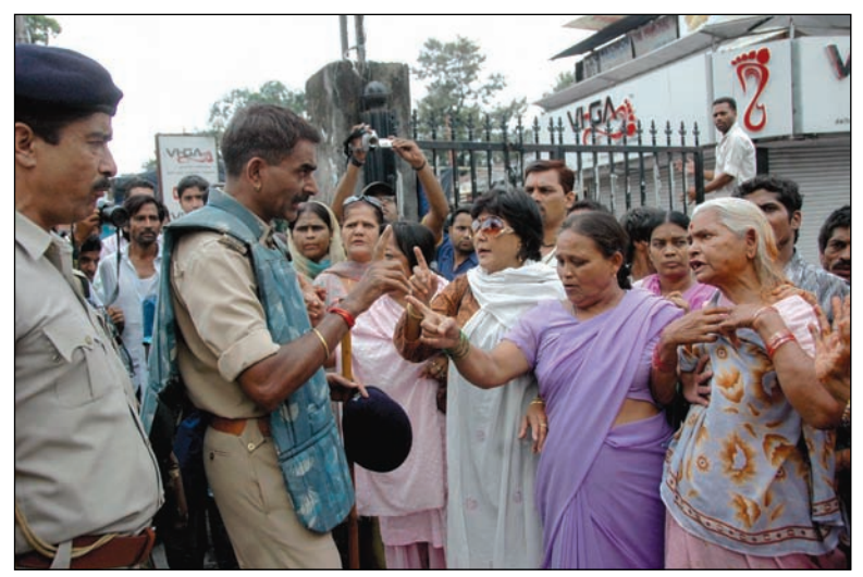
15. Women protestors arguing with the police (Courtesy: Vividha).