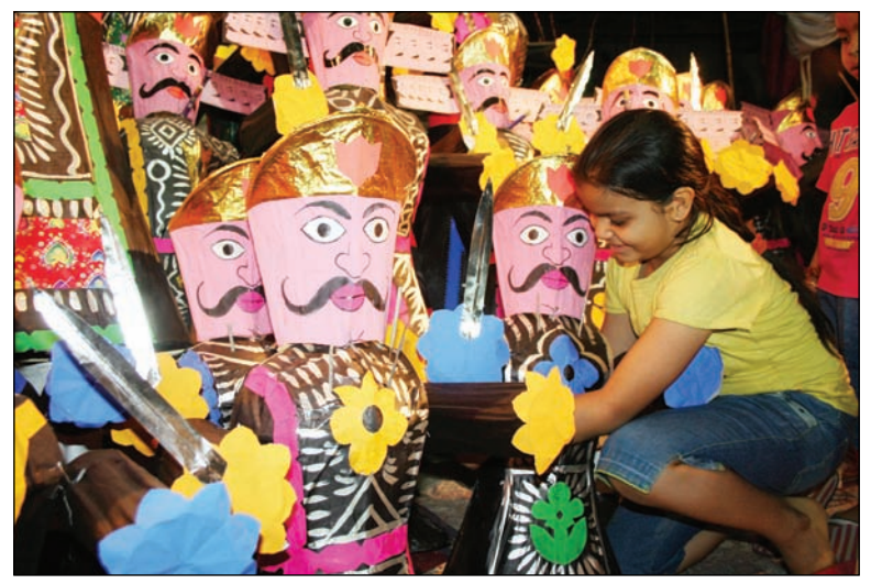
10. Understanding good and evil at a young age (Courtesy: Molina).