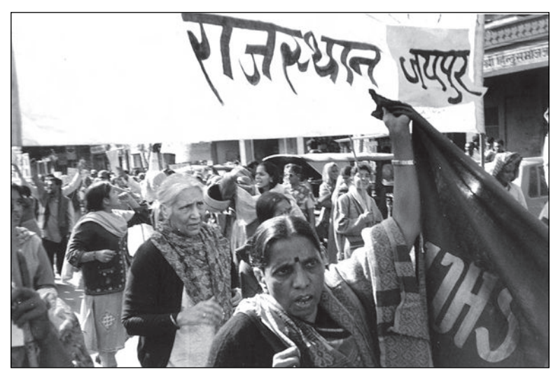
21. Protest march on the streets of Jaipur.