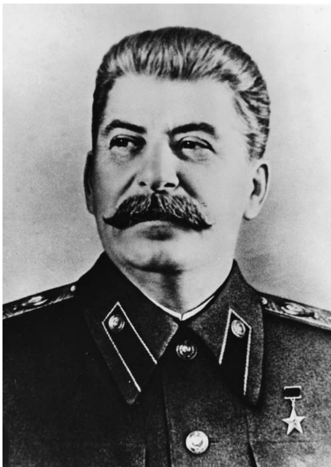
3. Josef Stalin