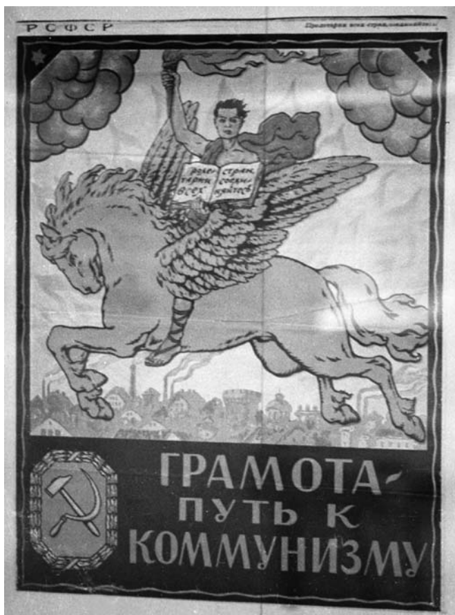
11. An early Soviet literacy poster (the caption reads 'Literacy – the Way to Communism')

explain why Russia, for example, did not have any structural unemployment benefits from 1930 until the beginning of the 1990s – they were considered unnecessary – and only opened its first unemployment office in decades in July 1991. It also helps to explain why people who have suffered unemployment and