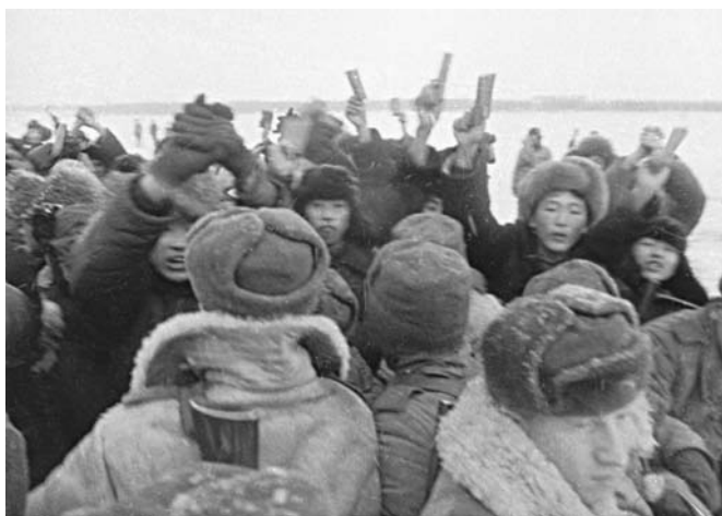
15. The Ussuri River conflict 1969

The 1969 events can in hindsight be said to have had some positive results. For the rest of the world, the most significant were that two major nuclear powers – the Soviets had tested their first nuclear