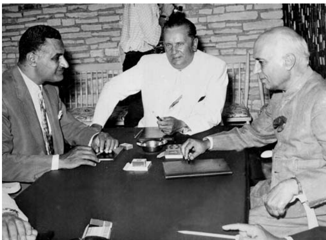
14. A meeting of Non-Aligned Movement leaders in 1956: Yugoslav leader Tito (centre) with Egyptian President Nasser (left) and Indian Prime Minister Nehru (right)

Power and bloc politics. While another Communist member of the NAM, Cuba, in practice often sided with the USSR, Communist Yugoslavia maintained an independent stance for most of the Cold War era.