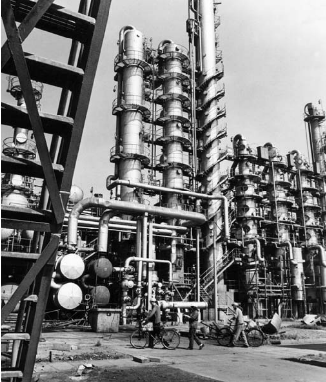
The economic system of communism

In theory, their control over the economy meant that Communists were particularly well placed to ensure that economic development was not at the expense of the environment. In practice, the commitment to economic growth at almost any cost typically meant the environment was a low priority, and most East European states had worse environmental problems by the 1980s