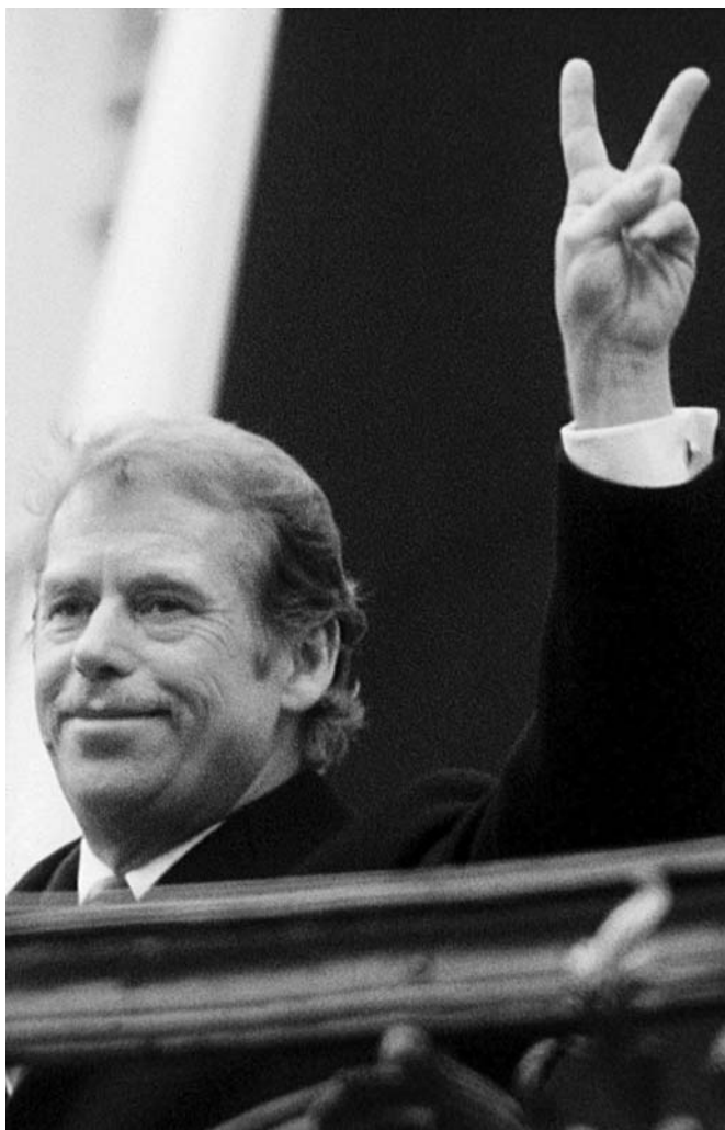
18. Czech dissident playwright and post-Communist president Vaclav Havel (1989)