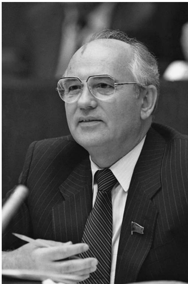
16. Last Soviet leader Mikhail Gorbachev