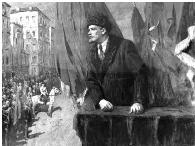
2. Vasili Yefanov's portrait of Vladimir Lenin, leader of the October 1917 Russian Revolution

Marx had said little about political parties, in part because they had not been as salient a feature in his day as they became in the 20th century. But Lenin believed that political consciousness of its exploited situation would be slow to develop in the Russian working class, and hence developed his theory of the vanguard party. In What is to be Done? (1902), Lenin argued that some people are much more politically aware than others, and should assume responsibility for leading society to socialism. This was an elitist approach to a political party, and has been compared to Plato's arguments in favour of rule by 'philosopher-kings'. Moreover, the party was to be highly secretive. While some have defended Lenin's position on the grounds that the type of clandestine and closed party he advocated was necessary in the repressive conditions of the Tsarist autocracy of the early 20th century, the fact is that the Bolshevik party – which eventually became the Communist Party of the Soviet Union – did not change many of its key features even after it had seized power. Indeed, Lenin called for much stricter discipline