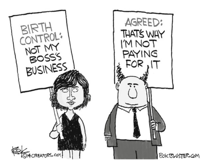
Fig. 5.1 Chip Bok Editorial Cartoon used with the permission of Chip Bok and Creators Syndicate. All rights reserved.

role of government is to ensure equality and justice through laws and regulations. These laws should also target the private sphere—as in the case of domestic violence or marital rape—as well as the behavior of individuals in the marketplace, a space that often fails to provide equal access and opportunity to certain individuals. In light of this account, pro-choice supporters understand the employer mandate not as a violation of women's freedom and autonomy but, rather, as a requirement that grants them reproductive choices and promotes equality in the marketplace and within society.