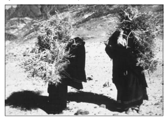
Figure 6.1a. Indigenous vegetation gathered for firewood.

Figure 6.1 (a-b). Firewood (hatab) gathered by hand.