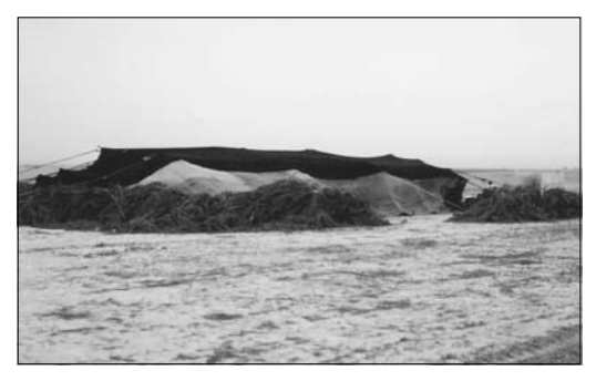
Figure 6.1b. Heaps of pine branches pruned in the Yatir Forest to be used for firewood.

A number of research papers: Bruins (1986), Evenari et al. (1971), Droppelmann et al. (2000), and Droppelmann and Berliner (2000), indicate the present-day potential of wadi areas to sustain agriculture when they benefit from run-off systems and annual flooding. This is so despite the ongoing Holocene and the diminishing precipitation rates, that were probably somewhat greater during the Byzantine era. Reconstruction of Nabatean-Byzantine systems by Prof. Evenari near Avdat, and archeological excavations in other places in the Negev Highlands and eastern Sinai, have provided the basis for measurement of the runoff water potential. The Nevo excavations (1991: p. 47 ff.), which also included plots on wadi slopes on which flood banks and stone terraces have been built, suggest that the ancient terracing method was used not only for farming, but also as part of a local tradition for the cult of spiritual entities. Nevo investigated the properties of the remains of these terraces from the late period of the permanent settlement in the Negev Highlands, which ended about 100 years after the Arab conquest. The upshot of the research is that the area could not provide food for a large population. The towns and villages of the Negev Highlands required massive assistance from the Byzantine central authorities and, after the latter's retreat from the Levant during the short interim from the middle of the seventh century until the last