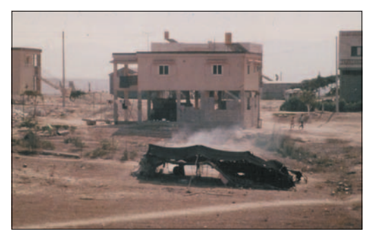
Figure 5.2b. Building the home, while dwelling in the tent.