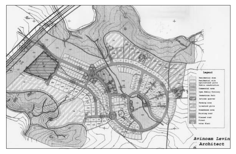
Figure 7.1 Design of a rural settlement for the Tarābīn aş-Şāne<sup>c</sup> (Be'er-Sheva Valley, Israel).