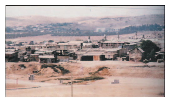
Figure 5.1d. Spontaneous settlement on the outskirts of a township (which can be seen in the distance).

an increase during the later years with the result that although the trend of settlement in towns continued, it did not keep pace with the massive demographic growth. The slowdown in the country's economy following Rabin's death and the new elections which brought the Netanyahu administration to power occasioned severe unemployment in the Bedouin sector and this diminished the settlers' ability to repay loans received for constructing their homes. Moreover, city taxes, in addition to income and