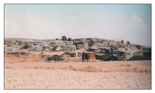
Figure 5.2a. A spontaneous settlement.

Figure 5.2(a-d) Phases in the Emergence of a New Bedouin Town.