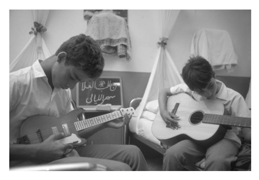
11. Boys play guitars at a Jeddah boys' school, undated.

the 1950s and, according to some reports, government schools barred Shiite teachers from leading classes on religion and history.<sup>50</sup>