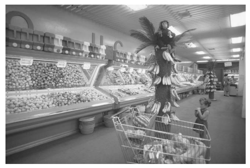
9. (TOP) Traditional produce stand, al-Hasa, 1980. 10. (ABOVE) Supermarket produce section, 1981.