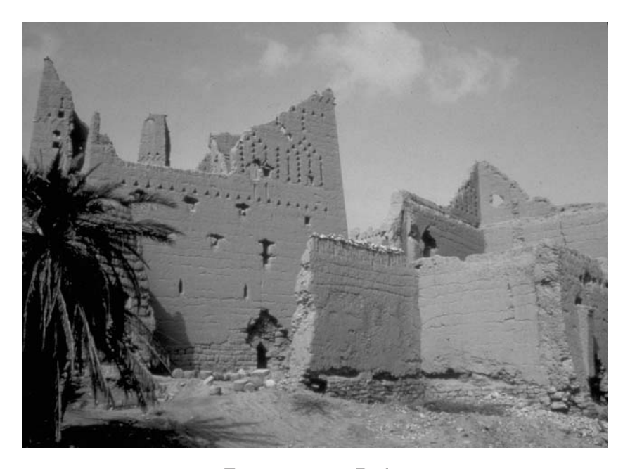
1. The ruins of al-Dir'iyya.

and enclosing walls were completely destroyed; refugees from the razed capital were camping in groves around Riyadh.<sup>125</sup> Ibrahim's ruthless prosecution of the war, al-Dir'iyya's levelling and the exile of the amirate's political and religious leadership gave the same impression to a sojourning European as it did to Arabian Bedouins and townsmen: The Saudi amirate and the Wahhabi mission had been crushed once and for all.