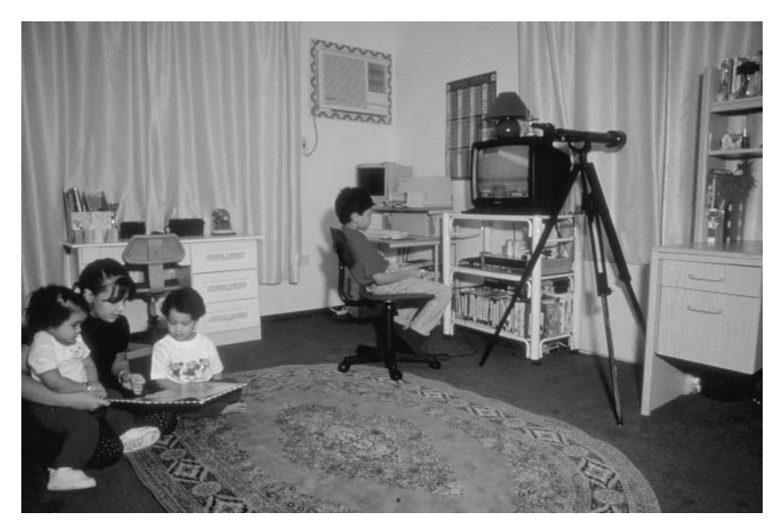
12. Television at home, 1999.