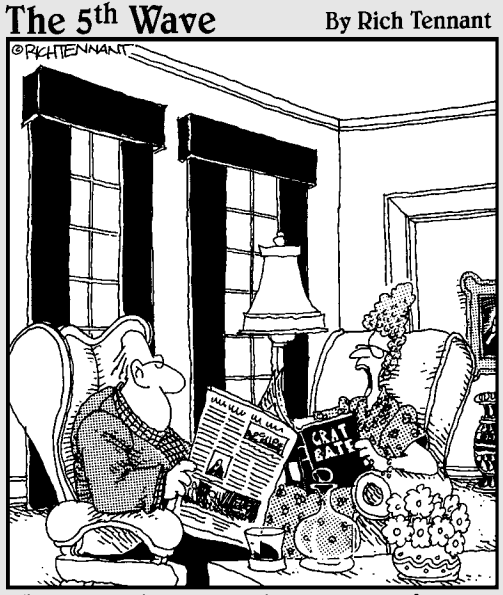
"...and don't tell me I'm not being frugal enough. I hired a man last week to do nothing but clip coupons!"