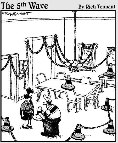
"Of course I'm proud to be married to a policeman. I just don't want to decorate every holiday with orange traffic cones and crime scene tape."