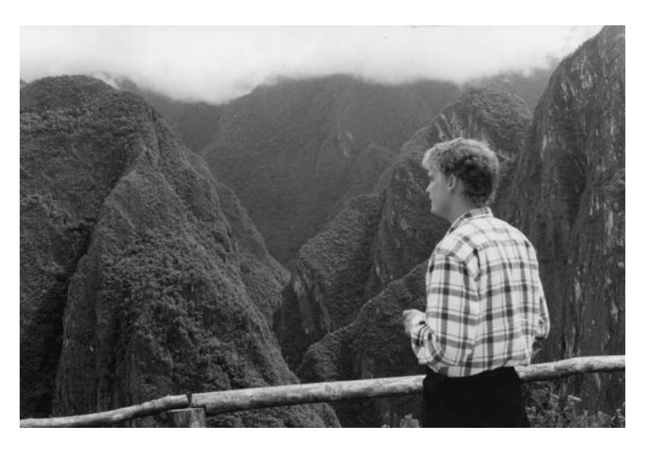
Walking in the Andes near the border between Chile and Argentina. For some, spectacular natural wonders are a spiritual and even moral counter to urban societies.