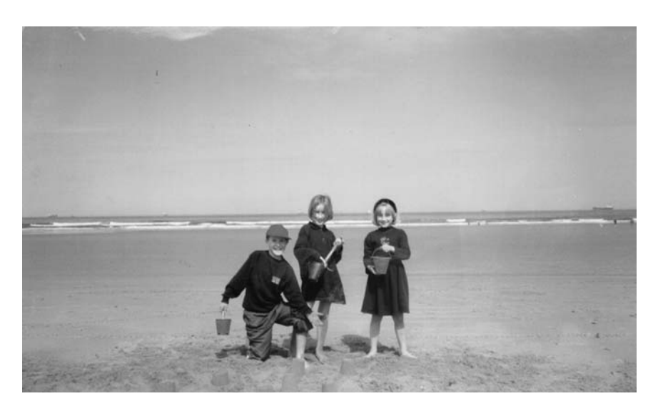
Innocent fun on Redcar Beach, Cleveland, in the UK.