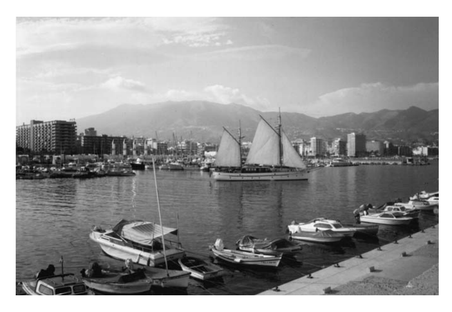
A view of the Costa del Sol, taken from the Fuengirola harbour wall. The Spanish Costas are popular with foreign and domestic tourists alike, yet remain a byword for damaging, 'unsustainable' development among many critics.