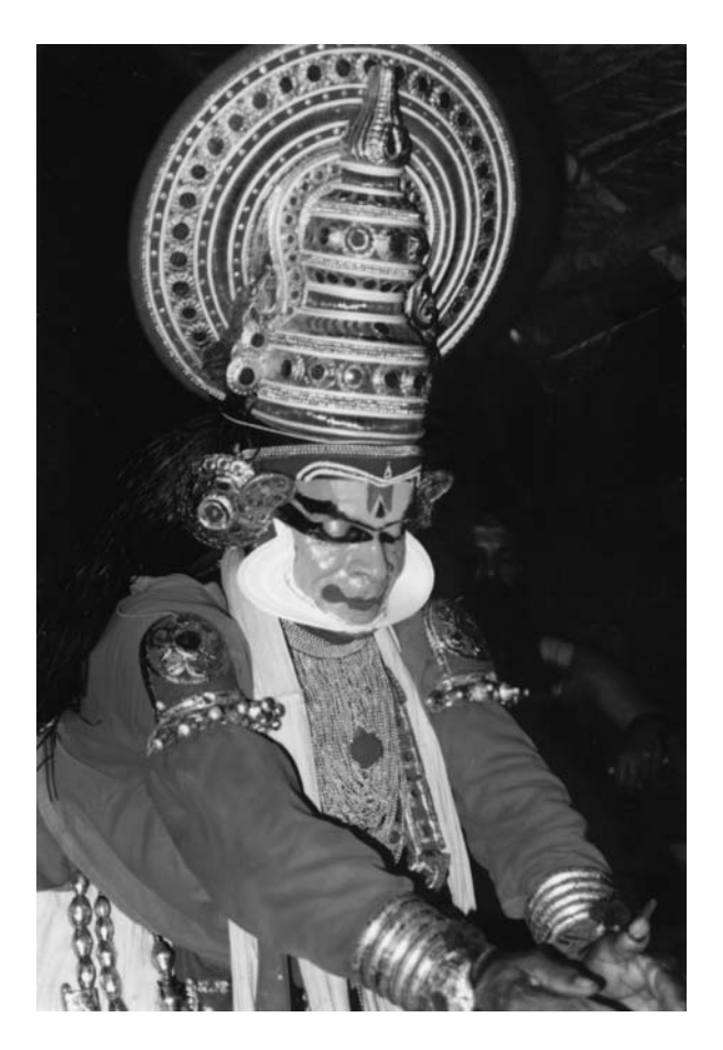
A Kathakali dancer in Trivandrum, in the Kerala region of India. 'Katha' means story and 'Kala' means performance. The performance, in this case, is for the tourists as dancers gravitate towards the cameras. Tourism has helped to revive the dying art of the telling of ancient myths and epics through Kathakali.