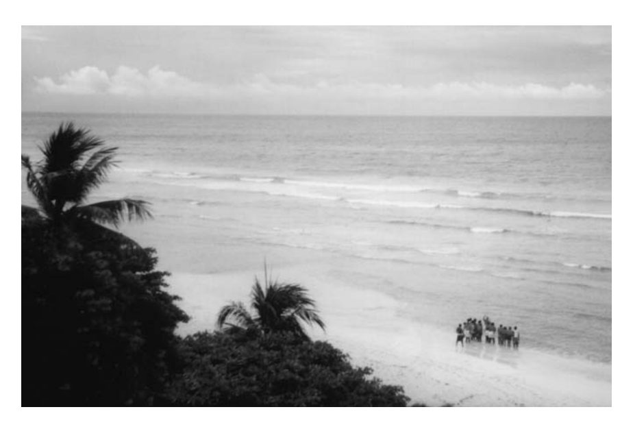
Tourists setting out to examine coral on a marine safari in Barbados.