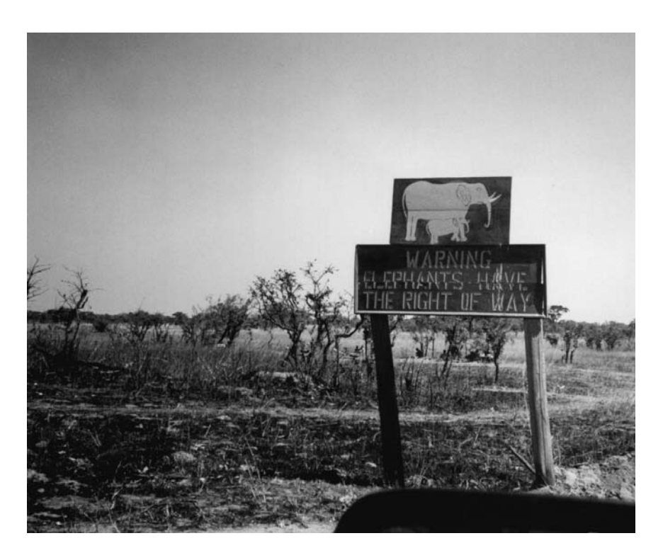
A sign in Hwange National Park, Zimbabwe.

Zimbabwe has a thriving elephant population, numbered at over 64,000, up from 4,000 in 1900. The non-governmental organisation funded 'Campfire' scheme supports the elephant population through ecotourism and organised hunting in communual lands, thus giving the elephants an economic value and creating an incentive for Zimbabweans to get involved in conservation. The success of Campfire is seen as turning elephants from 'foe to friend' in communual areas, which often buffer national parks and hence are prone to crop damage or even threats to life from marauding elephants from the parks. It is estimated that around 250,000 Zimbabweans are involved in managing their natural resources through the Campfire scheme.