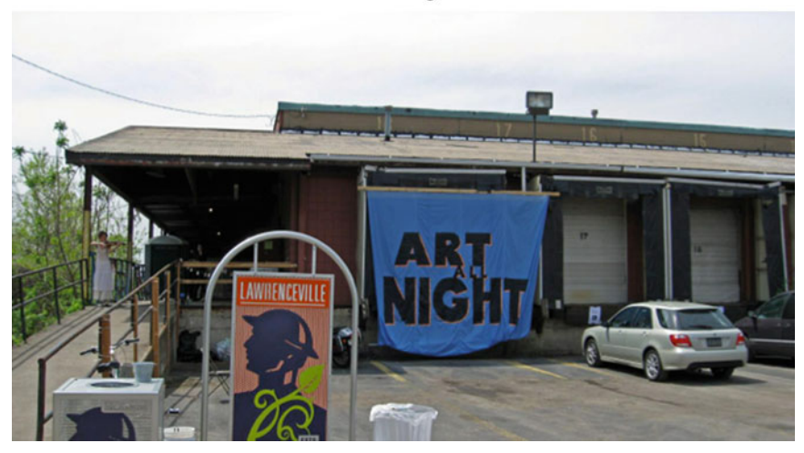
Art All Night 2008