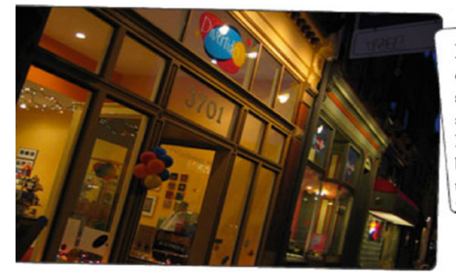
Divertido "We choose interesting, skilled artists and artisans from Pittsburgh and beyond to offer you uncommon stock." 3701 Butler St