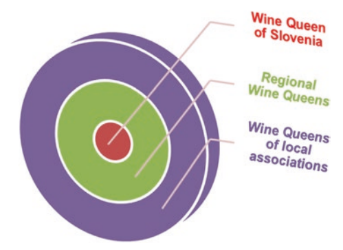
Fig. 3.2 The types of wine queens in Slovenia.

The regions with the most wine queens overlap with the wine growing areas in the northeastern, western and southern Slovenia, with the exception of non-wine growing areas (Kuljaj 2005: 186; Šoštarič 2011: 9; Curk 2011: 17–25; Pavček et al. 2003; Ramšak 2012: 101, 2013: 79–80, 2014: 48) (Fig. 3.2).