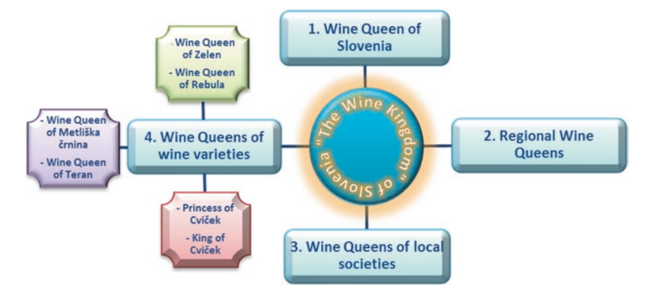
Fig. 3.1 The structure of the "wine kingdom" of Slovenia.