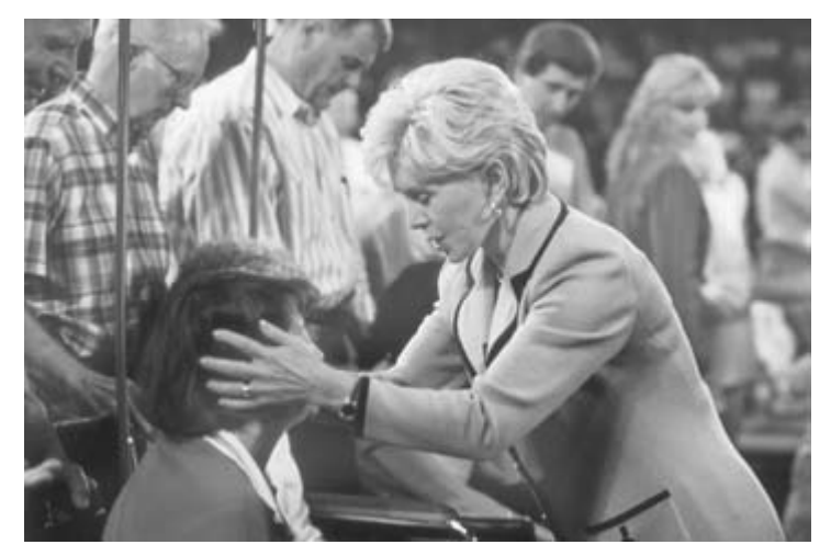
ı. Gloria Copeland at a healing revival.