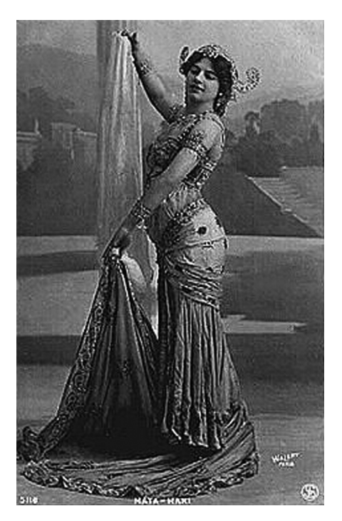
Figure 9.3 Mata Hari, photograph c. 1910. Picture from Kitty's collection. Digital inkjet print, 10" x 8".