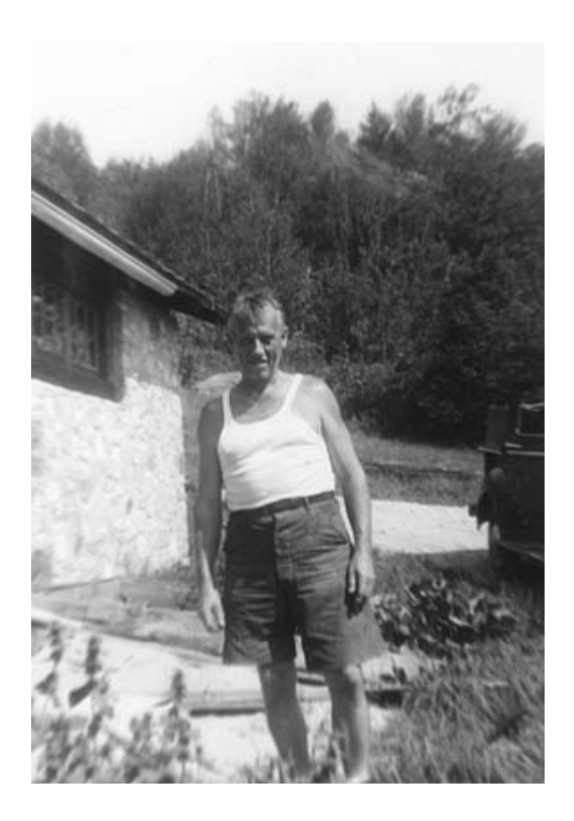
FIGURE 9. Scott Nearing at the Vermont homestead in the 1940s.

munist Party. As the novel begins, Jim is struggling to understand the forces that have kept his family poor and oppressed and made it unlikely that they could improve their social and economic position. Intelligent and energetic, Jim is the family's best hope for improvement, but he is skeptical about the value of education in a region where black schools are routinely burned down. He is even more skeptical about his family's devotion to the church and to God, proclaiming, "Ef God done run de world, he sho' must be white!" While Jim dutifully