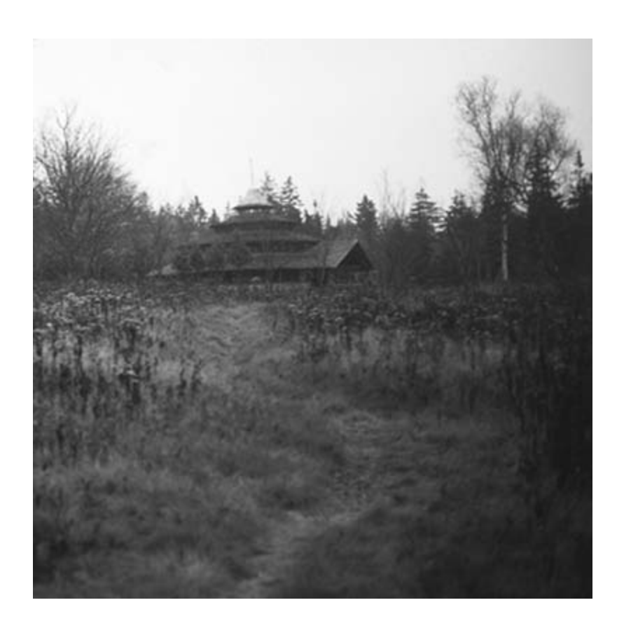
FIGURE 2. Bill Coperthwaite's main yurt beckons from a distance.

and chief resident of this rustic kingdom. A visitor walking from the main house to the shoreline will soon stumble upon a guest yurt—capable of housing fifteen to twenty visitors—perched at the end of the slope. At the shoreline itself, an outdoor shower is rigged up and ready for year-round use by anyone seeking a bracing wash. Around the bend stands an outdoor kitchen with fire pits, benches, tables, and cookware all ready for the next summer of full-time use. The boathouse, occupied by several hand-crafted canoes, is situated just below the kitchen outpost. On the return toward the main house, other, smaller yurts come into view, though their shape and natural wood coloring keeps them half-camouflaged in the tall grasses: a study, a "cache yurt" for food storage, and an outhouse yurt, each with its own whimsical touches.