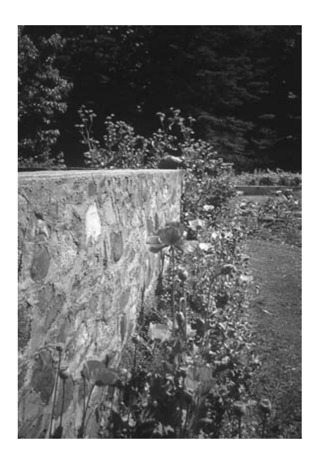
FIGURE 3. A stone wall in Helen's garden.

the longing to build again in stone. They express the desire to have an occasional project that carried with it the "absence of any compulsion" and would serve, in their words, as "our tennis and our golf" for the fourteen years it took to construct. ¹5 Clearly, the wall was built for Scott and Helen's sake as much as for the sake of the garden. While a fence would have been sufficient to protect their food, the act of building the wall fed other human hungers.