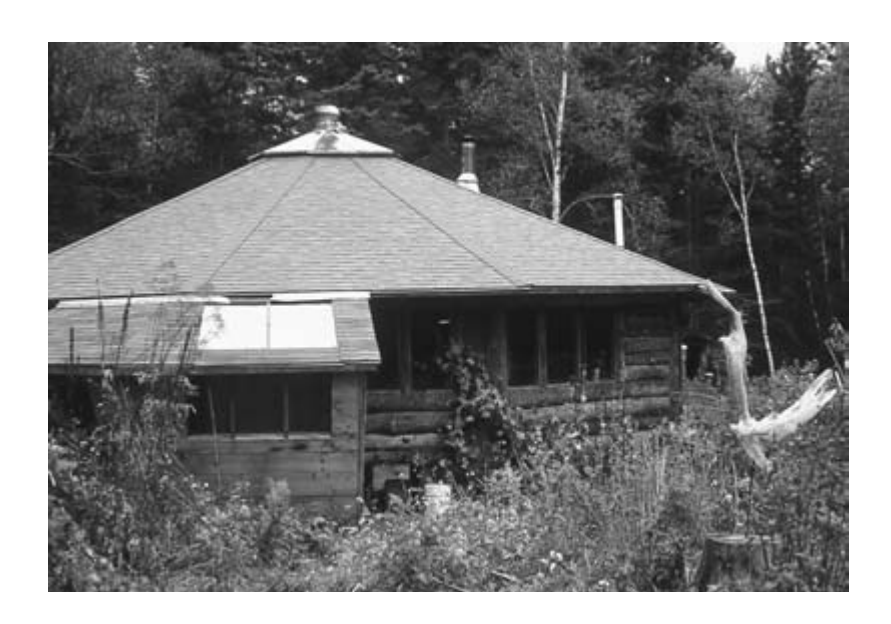
FIGURE 4. Sal's homestead and sauna express a contrasting approach to the Nearings' strong sense of order.

sons for no-till planting go far beyond the intention of maintaining a fruitful garden, just as Helen and Scott's reasons for building stone walls were not simply utilitarian.