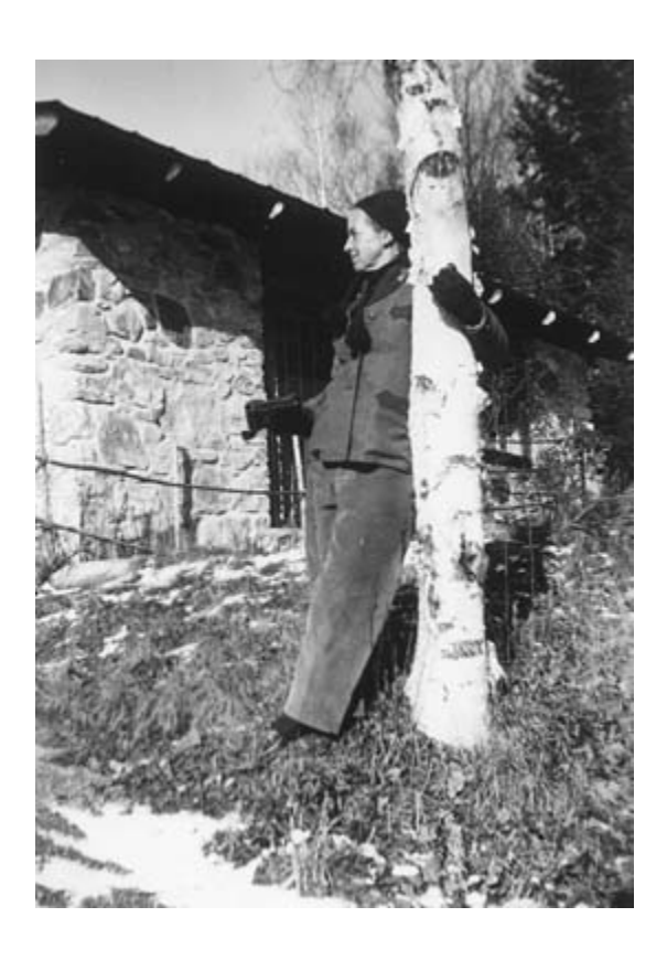
FIGURE 10. Helen Nearing at the Vermont homestead in the 1940s.

goes to school, attends church, and even participates in Sunday school, he longs for something more, a something he once experienced as a child, playing by the river and talking with flowers.<sup>83</sup>