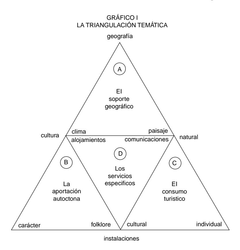
Figure 1 The Tourism Communication System.

interlocutor or You at the other end of the chain through a message that was included in a wider referential space or Id. Following this sequence each one of the isotopic triangles had a special function. Triangle A referred to the Id, the geographical environment of the given attraction or product. Triangle B was the space of the Ego, the emissary of the information. It included the human and cultural infrastructure. The You triangle (C) referred to the act of consumption proposed to the receiver. Finally, the specific services that the consumer could expect to obtain were included in Triangle D, where the Ego, the You, and the Id converged. By combining these different aspects of all four triangles, it was possible to reach the complete repertoire of the themes all the class brochure had in common. In alphabetical order the