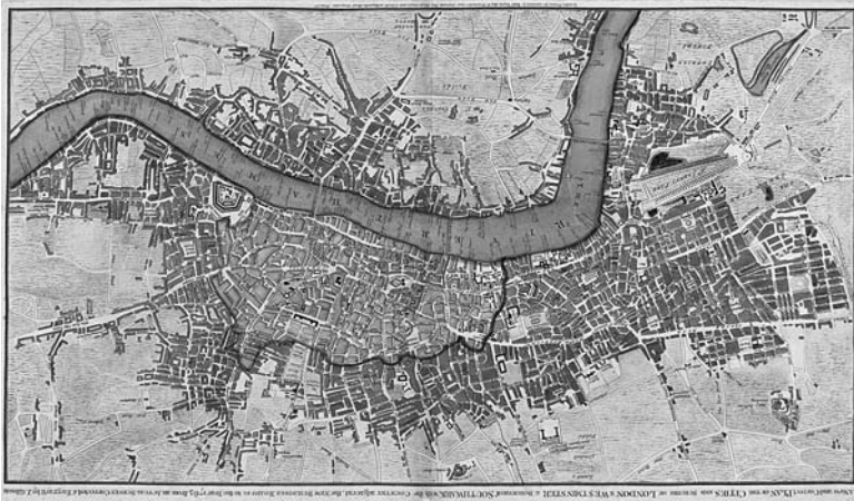
Figure 2.1 Map of Westminster, the City of London, Southwark the River Thames and the surrounding areas leading out to the countryside, by J. Gibson. (1763)

those City officers not covered by the courts of Aldermen and Common Council. By the early nineteenth century the court became more closely involved in policing matters, a situation that was rooted in the 1790s when the City authorities became concerned about the impact of Patrick Colquhoun's proposals to police the river Thames, and in particular the extension of powers of arrest within the City proper. 7 However in the eighteenth century it would appear that the court was rarely involved in day-to-day responses to criminal activity in the City.