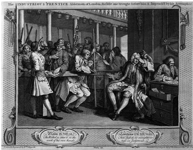
Figure 2.2 The Guildhall Justice Room, by William Hogarth 41

What form did the hearings before the magistrates take in this period? The scene in the Guildhall justice room is illustrated by Hogarth in Figure 2.2, as Jack Idle is brought before his more industrious former