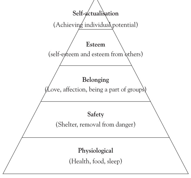
Figure 4.1 Maslow's hierarchy of needs pyramid

While it is difficult to access at what point people are concerned with the general welfare of the wider society around them, it would be safe to assume it emerges at or after the middle level, Belonging , where socialization and relationship needs emerge. Both below and above this middle step individual needs tend to dominate. Companies must therefore be careful in choosing the right universal CSR path to align their activities with, as what plays in one society may not be appropriate, according to the Maslow criteria, in another.