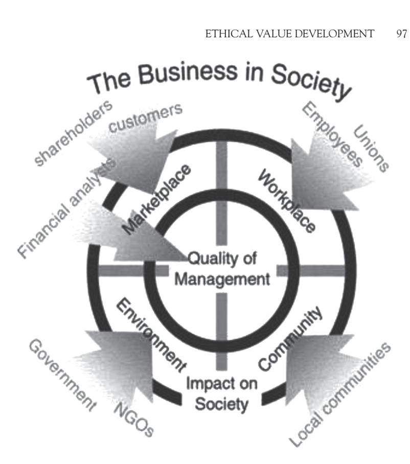
Figure 3.2 The integrated circle of social responsibility