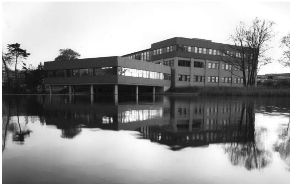
Figure 1: AstraZeneca Clinical Trials Unit, South Manchester