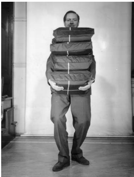
Figure 4: Professor Desmond Laurence and his monthly burden of documents for a meeting of the Committee on Safety of Medicines.

green bags that used to flood on to the desk. We published it in the issue of the British Journal of Clinical Pharmacology that we produced to celebrate the 30th anniversary of the journal. It is worth looking at the issue just for the picture of Desmond, which was wonderful.