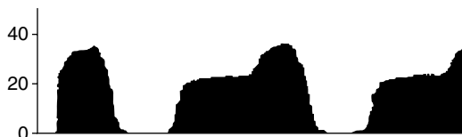
Fig. 14.2 Biphasic, dual plateau waveform. Reprinted, with permission, from Jaffe et al. [1]

A biphasic, dual plateau waveform has been described [2] (Fig. 14.2). The cause of this abnormal wave form is due to room air being drawn into the sample line before it enters the analyzer. This is often caused by a leak or a loose connection anywhere between the elbow connector and the gas analyzer. During expiration, the room air enters the sample line because of the negative pressure caused by the sampling pump's suction. The entrained air dilutes the expiratory \text{CO}_2 in the sample. However, with the onset of positive pressure mechanical ventilation, the pressure gradient across the leak reverses. The leak is now outward, thereby eliminating the dilution effect. The result is a late expiratory plateau prior to the normal down slope of the capnograph waveform. Since \text{CO}_2 was not used during the preoperative machine check, the problem was not discovered.