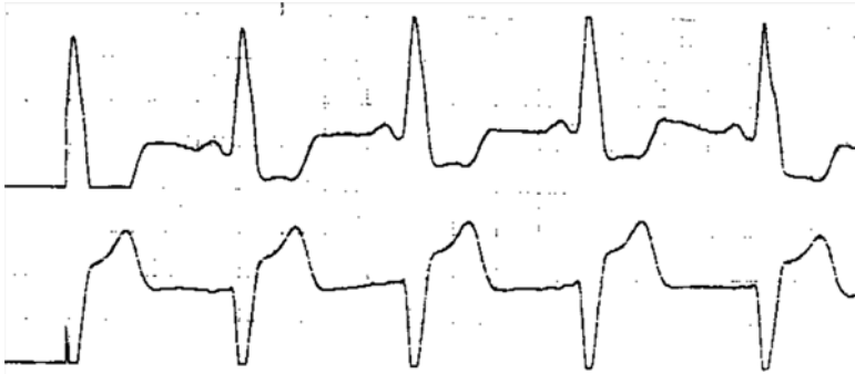
Fig. 74.1 EKG strip