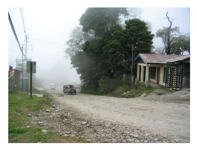
The road to central Santa Elena.