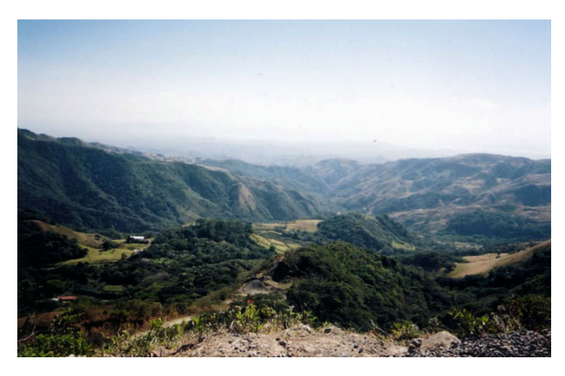
View South from the village of Monteverde on the road to San Luis.