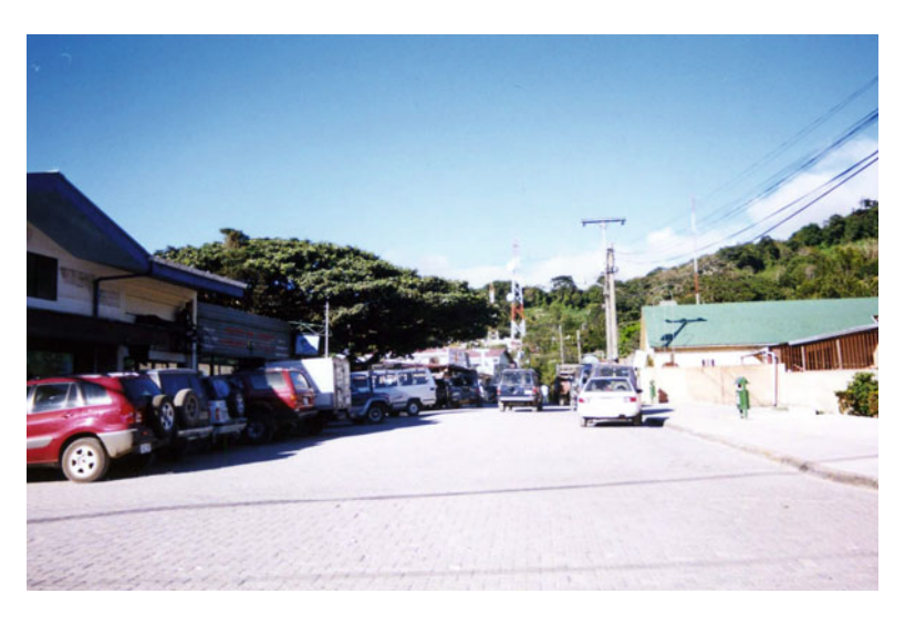
Central Santa Elena. To the left are shops and a hotel, to the right is the Catholic Church and parochial hall. This is part of the only length of paved road in the district.