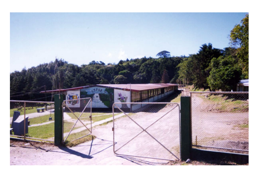
The main building of the Colegio in Santa Elena. Beyond are a second school building, pasture for cattle, an experimental fish pond, and a building for chickens and pigs. To the right (just out of sight) is the office of the Santa Elena Reserve.