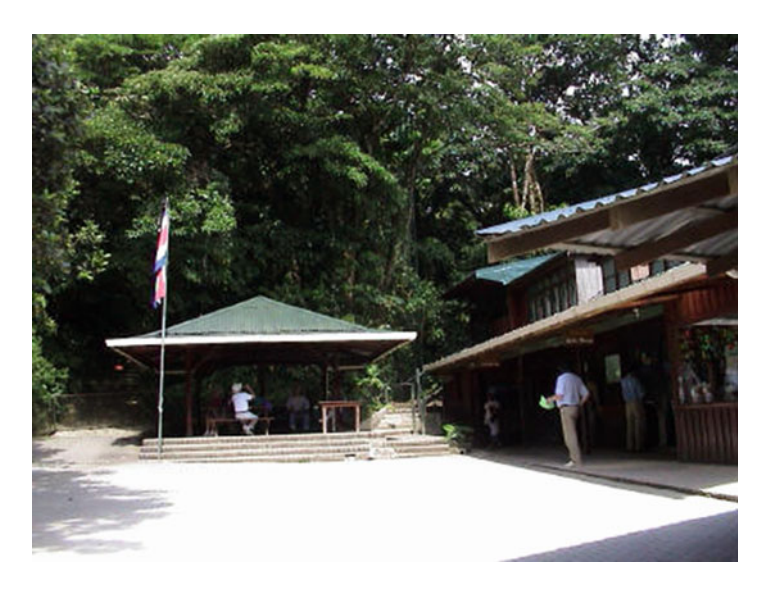
Main entrance and administrative buildings of the Monteverde Reserve.