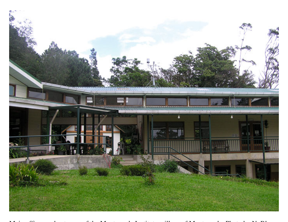
Main offices and entrance of the Monteverde Institute, village of Monteverde.