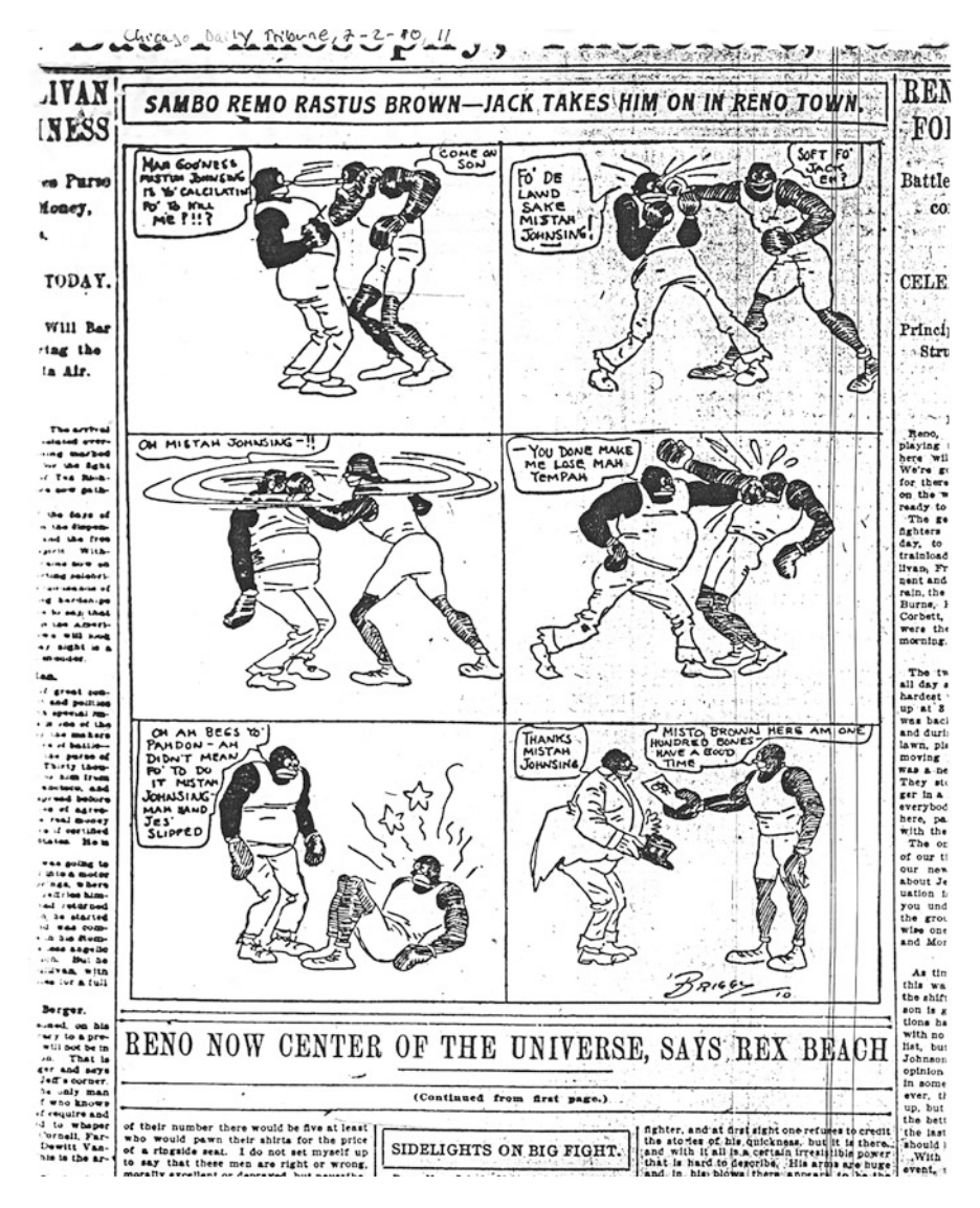
Fig. 16.2 Brown in the ring with Johnson

crouching in subservience replies, "Am dis mistah Jeffries oh – po'ed Lawdy what a big man – po' Jack."