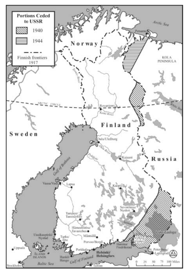
Independent Finland. Adapted from Osmo Jussila, Seppo Hentilä, and Jukka Nevakivi, From Grand Duchy to Modern State: A Political History of Finland since 1809. (London: Hurst, 1999), 100. Adapted with permission.