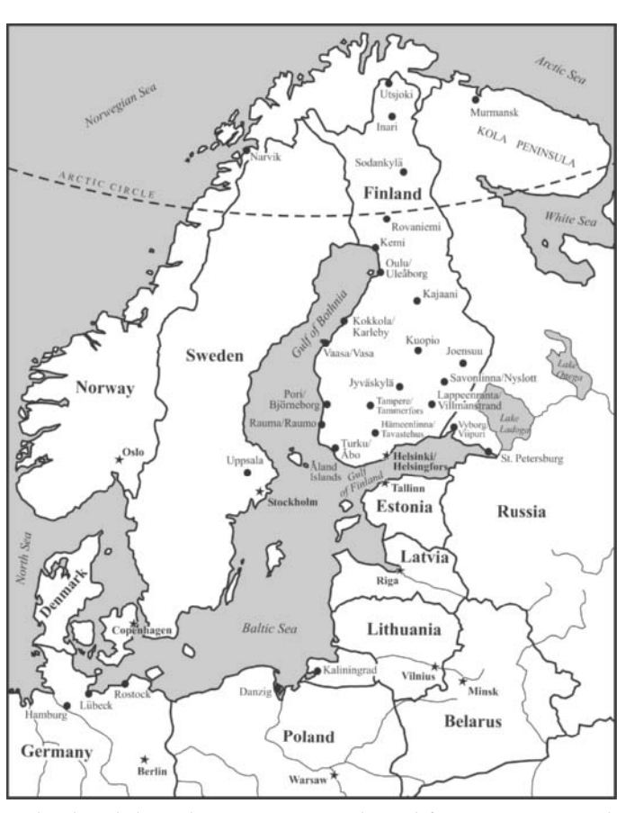
Finland and the Baltic Sea region. Adapted from Byron J. Nordstrom, The History of Sweden (Westport, CT: Greenwood Press, 2002), xii. Reprinted with permission.