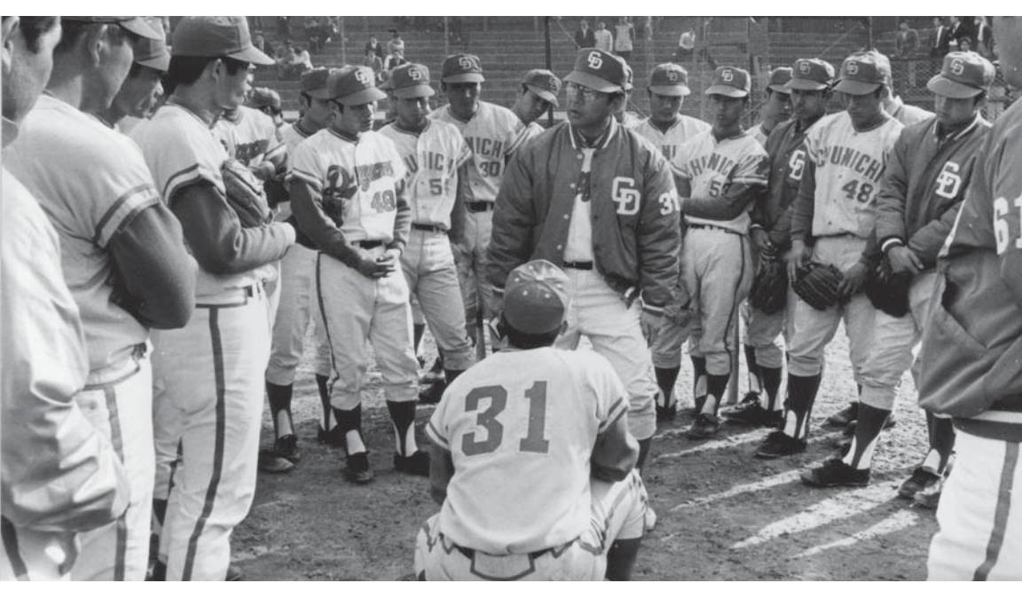
17. Wally instructs the Chunichi Dragons.

18. Wally is tossed by a sea of fans after winning the Central League pennant in 1974.