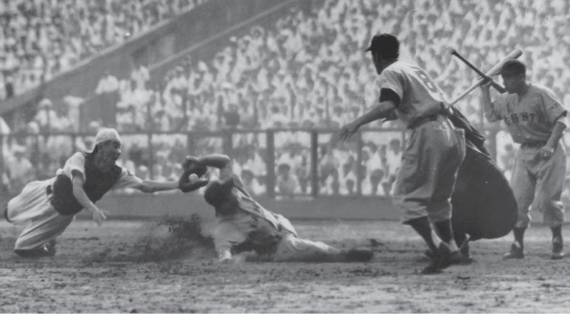
7. Wally uses his famous hook slide to score in 1951.

8. Always trying to fit in, Wally wears a yukata and geta .