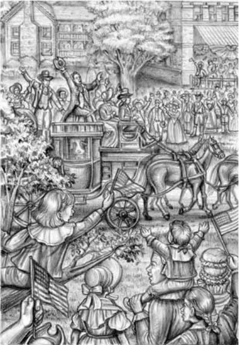
General Lafayette took his hat from his head and waved to all the people along the way.