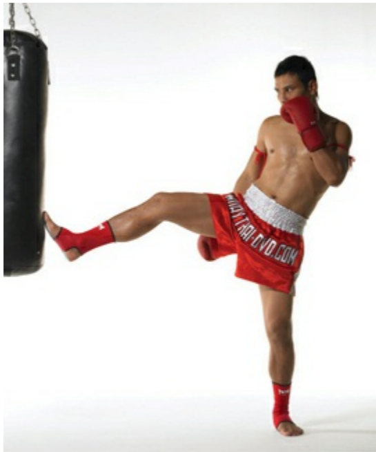
A: Saiyok the front push kick from a southpaw stance.