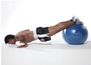
A-B: The starting and ending positions.