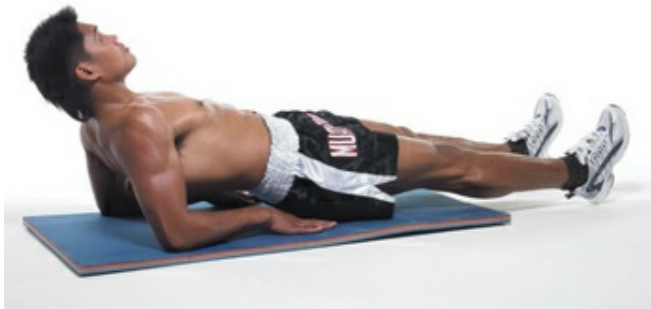
A-B: The starting and ending positions.