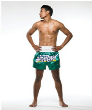
A–B: Moving the head.