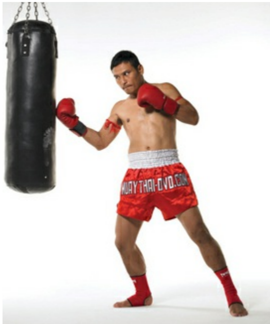
A: The front uppercut from a southpaw stance.