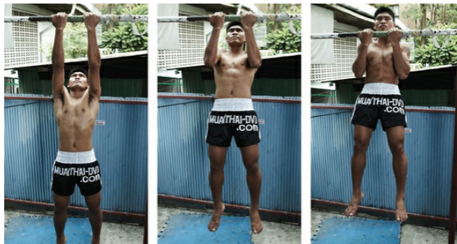
A-C: Pull-up sequence.

You can also grip the bar at shoulder width with the back of your hands facing forward. A very effective variant is pulling yourself several yards up a rope. You can achieve a similar effect if you put a towel around a high object, grab the ends of the towel, and pull yourself up.