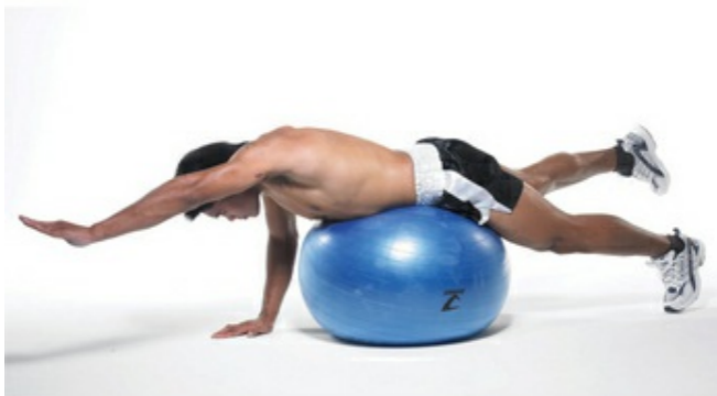
A-B: The Superman sequence.