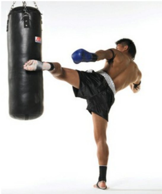
A: The round kick with the front leg.