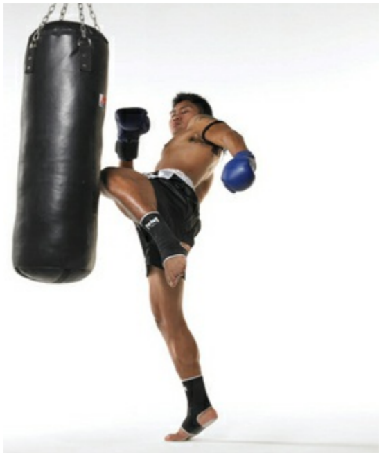
A: The front knee kick.