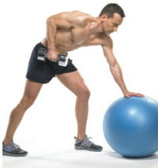
A-B: The starting and ending positions.