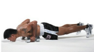
C-F: Rowing pushups.

Pushups on the fists help stabilize the wrists. Doing fist pushups on an exercise ball is very intensive.