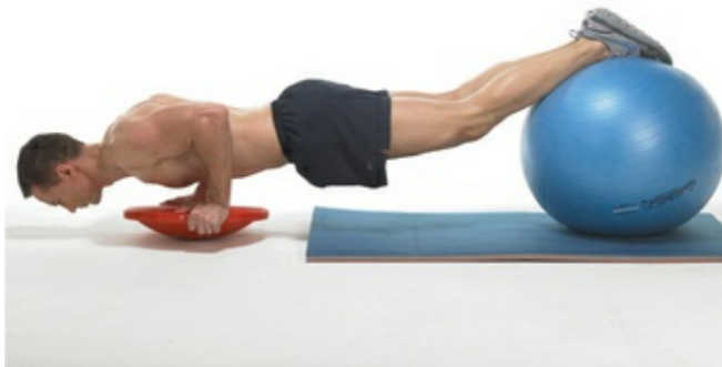
Pushups with a balance board and an exercise ball.

used this equipment before, you should put it to the test in these exercises. Training with equipment helps improve the interplay of muscles and provides excellent strengthening of the trunk muscles.