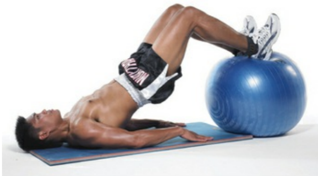
A-B: Rolling the exercise ball.