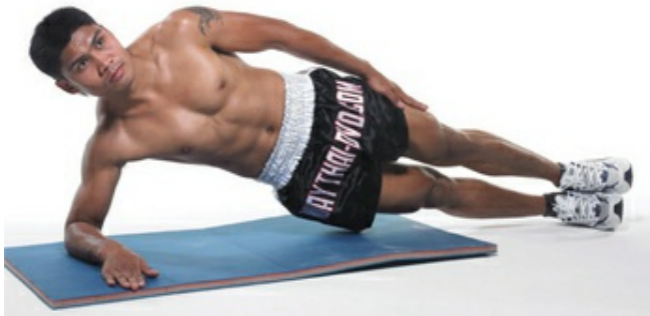
A-B: The starting and ending positions.