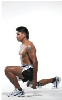
A-C: Lunge step sequence.