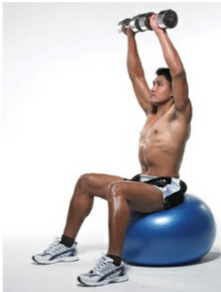
A-B: The starting and ending positions.