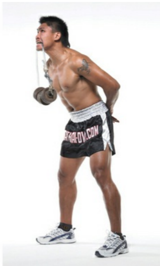
A-B: Tension on the back of the neck.